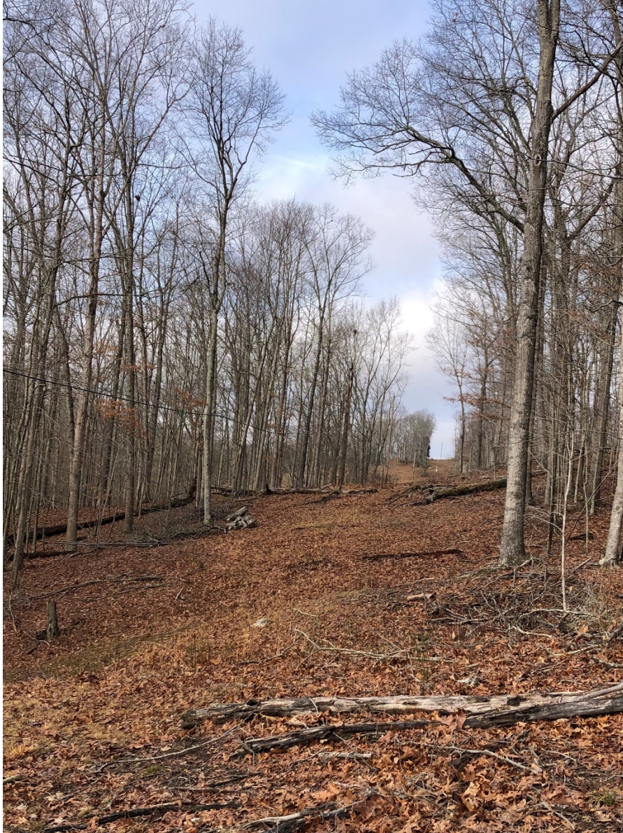
Single-phase right-of-way of the Hayward – Lawton circuit that serves approximately 60 customers in Elliott County. The Hayward – Lawton was fully recleared in year 2017. This photo was taken January 13, 2020.