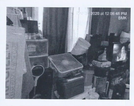
113 - INTERIOR SURFACE(S)/ CEILINGS/ WALLS/ FLOORS [156.054-C/156.054-C-1] New Violation Inspector Comments: Various areas throughout the house needs the walls repaired and ceiling also floors, in a workmen like order.

Subject violation needs to be in compliance on or before January 24, 2021 to avoid additional fines and court action.