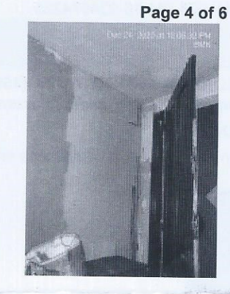
107 - EGRESS FROM STRUCTURE [156.201-A,B,C,D]

New Violation Inspector Comments: Need to remove miscellaneous items from blocking the windows there must be a clear path for egress of windows