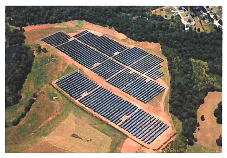
Figure 1: Utility-scale solar facility (5 MW<sub>AC</sub>) located in Catawba County.

The system installation, or construction, process does not require toxic chemicals or processes. The site is mechanically cleared of large vegetation, fences are constructed, and the land is surveyed to layout exact installation locations. Trenches for underground wiring are dug and support posts are driven into the ground. The solar panels are bolted to steel and aluminum support structures and wired together. Inverter pads are installed, and an inverter and transformer are installed on each pad. Once everything is connected, the system is tested, and only then turned on.