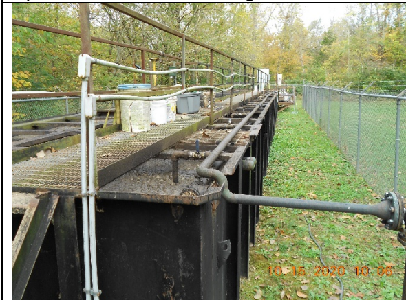
No air jet valves in full open position.