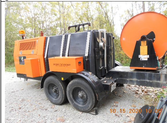
Hydro Jet Cleaner for clearing sewer lines