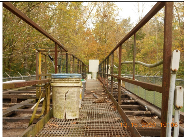
See no repairs to walkway