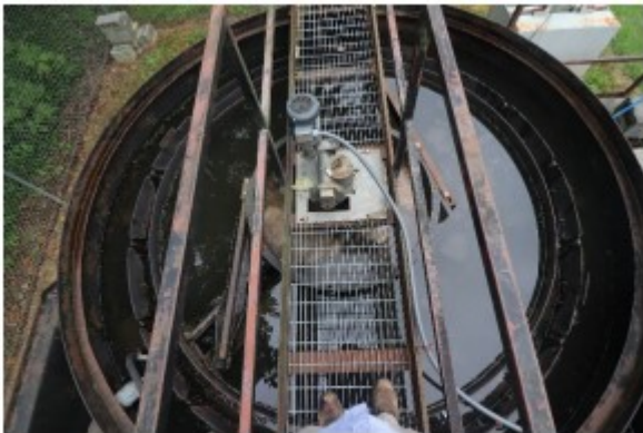
Reworked clarifier functioning properly