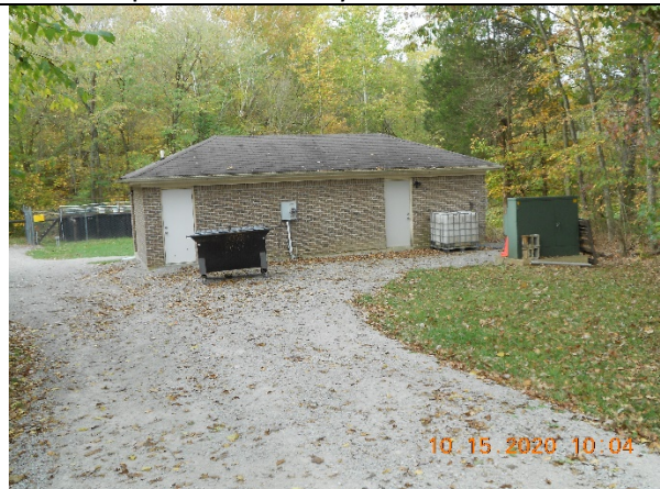
No repairs to blower house needed