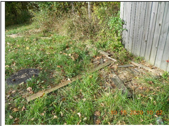
Fence not repaired just torn down and laying in grass

Pictures taken by Gary Esterle October 16, 2020