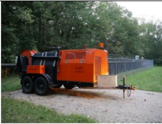
Backup generator on site for emergency power.

Pictures of repairs made since purchase presented September 28, 2020 by CSWR