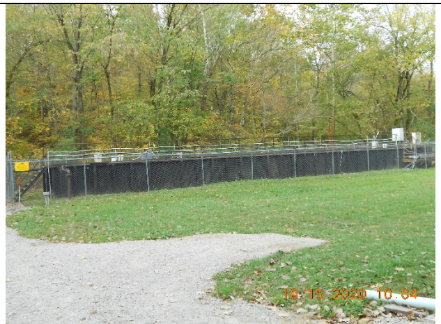
Same chemicals and more improperly stored