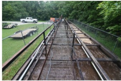
Damaged walkway sections replaced to ensure safety

This is not a generator. Equipment just stored on site. Hydro Jet Cleaner Mod. # 747-FR2000