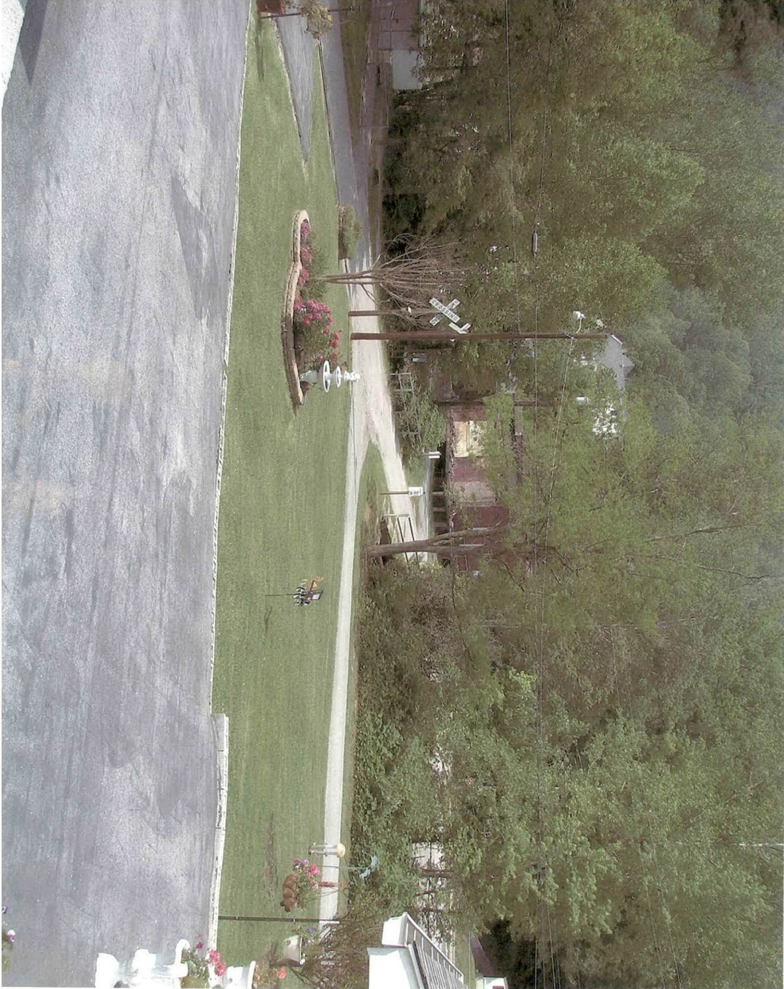
Case No: 2015-00421