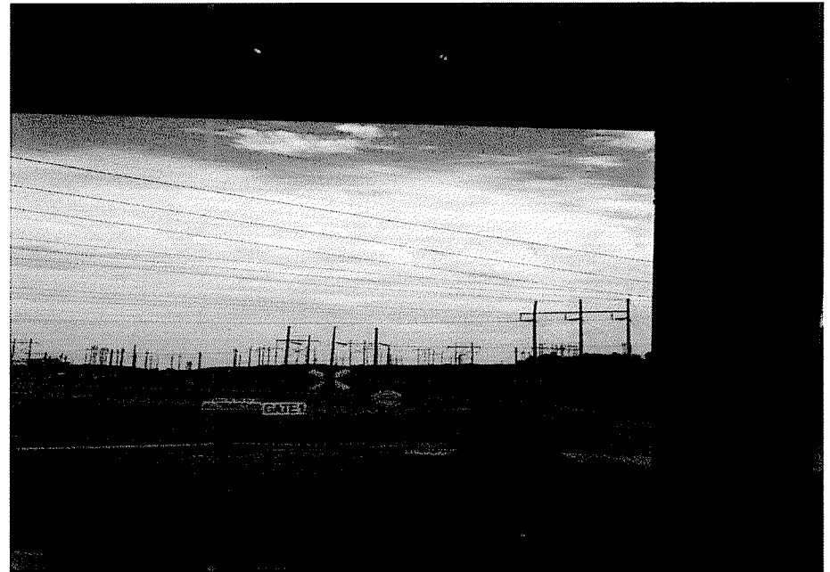
Southern terminus of proposed transmission line route - near Big Rivers' Reid Plant substation