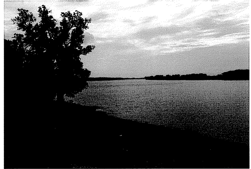
Henderson waterfront park – looking west