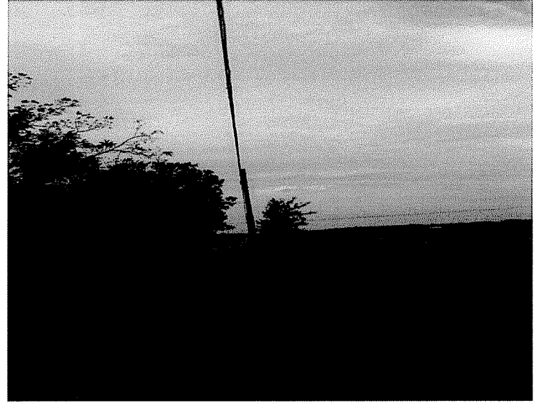
Portion of route north of Robards - 3