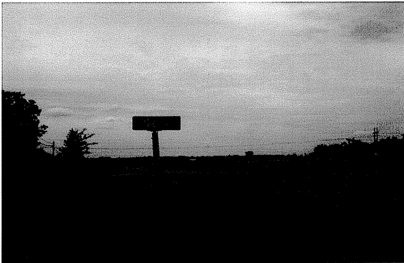
Portion of route north of Robards - 2