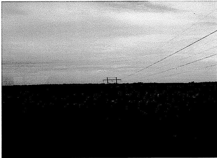
Southern portion of route - 3