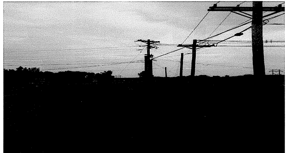
Southern portion of route - 1