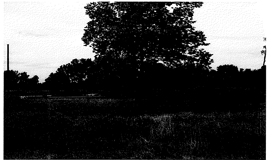
HWU property to the east of wastewater treatment plant - 2