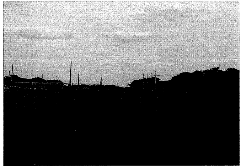
Henderson Municipal Power & Light Substation #4