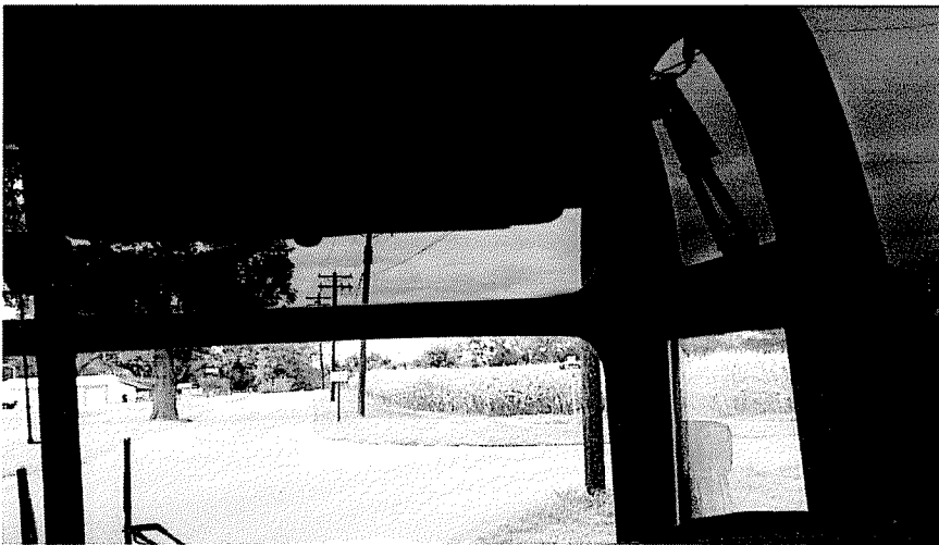
HWU wastewater treatment plant property