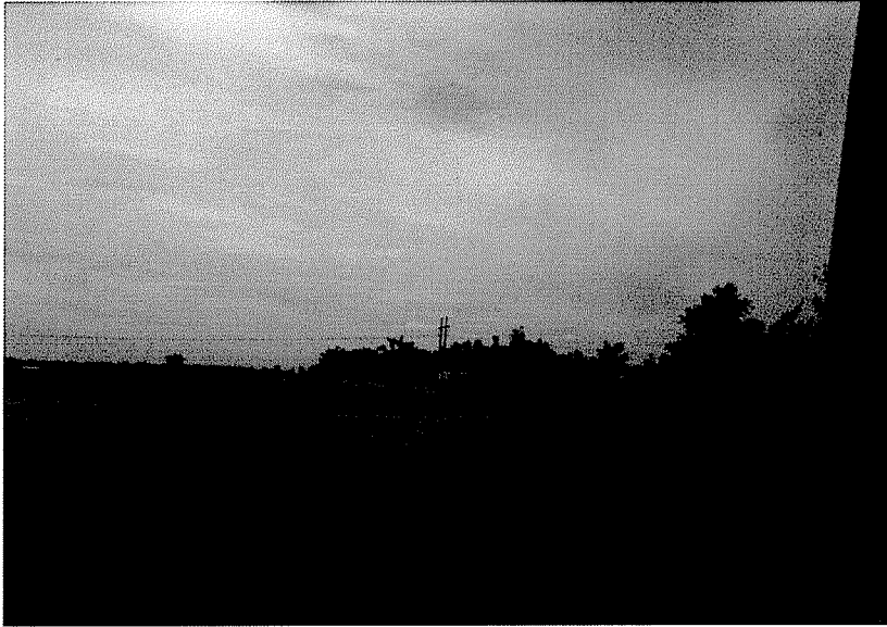
Portion of route north of Robards - 1