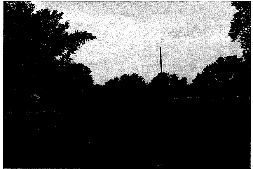
HWU property to the east of wastewater treatment plant - 1