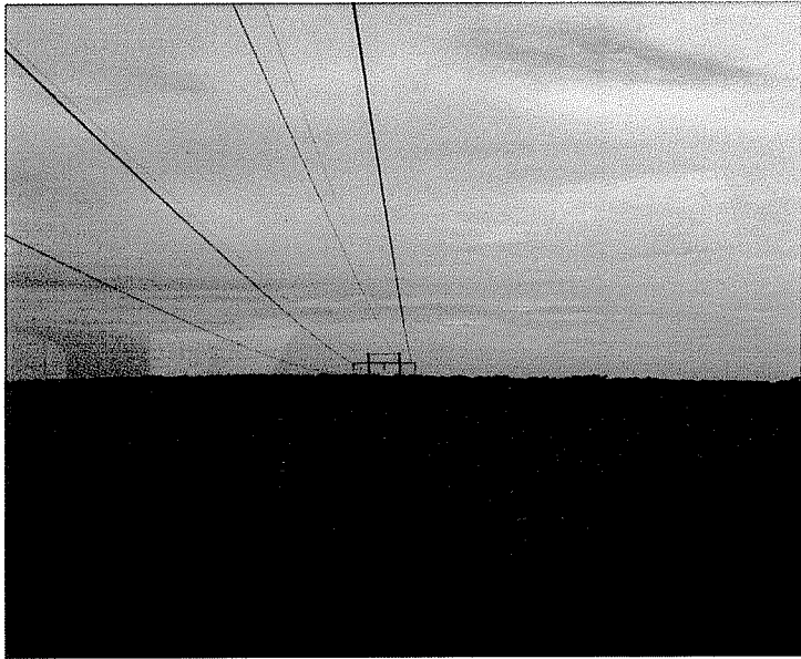
Southern portion of route - 2