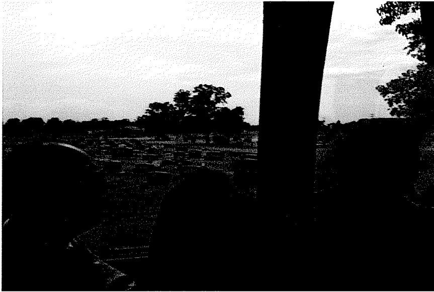
Cemetery adjacent to Henderson Water Utility (HWU) wastewater treatment plant