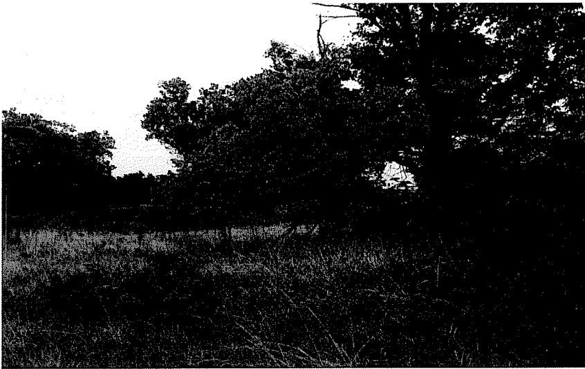
HWU property to the east of wastewater treatment plant - 3