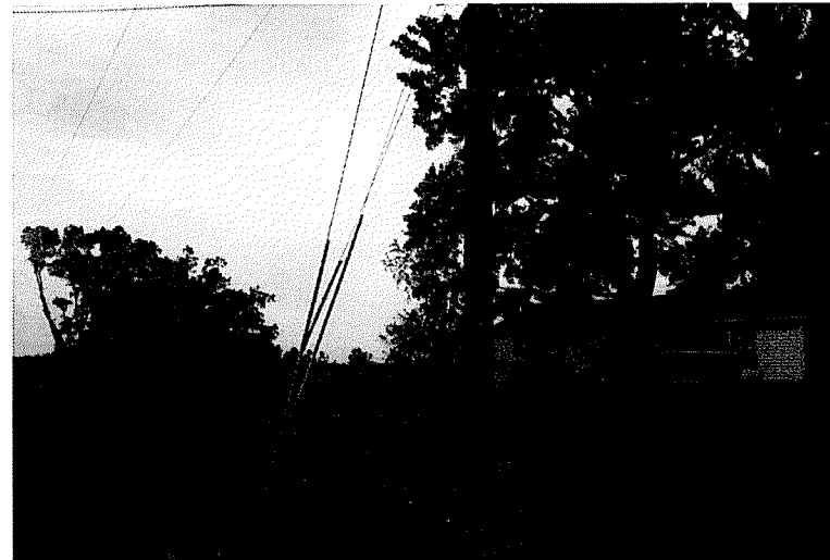
Community of Robards - 2