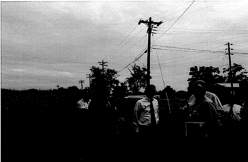
HWU property to the east of wastewater treatment plant - 4