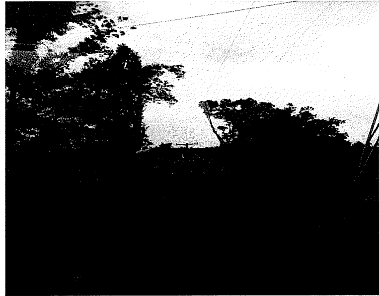
Community of Robards - 1