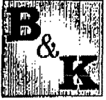
EXHIBIT B BERRY & KINGTON, PSC CERTIFIED PUBLIC ACCOUNTANTS

2822 North Main Street Madisonville, KY 42431 Phone: 270-821-3355 Fax: 270-821-0101 email: cpas@berryandkington.com