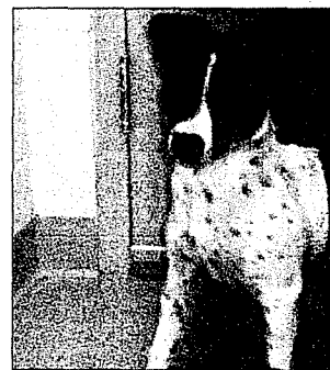
Hermes, a Jack Russell and border collie mix, whose adoption number is P09-3722.

Looking for a new pet? The Boone County Animal Shelter has several dogs and cats available for adoption. Choose from, including Miley, a beagle, whose adoption number is D09-4070. Adoption fees for adopting a dog or puppy are $119. Call 502-781-1111 for more information.