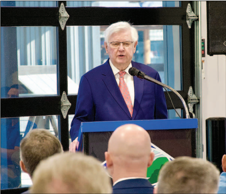
U.S. Congressman Hal Rogers speaks in front of a crowd of local officials and business leaders during Tuesday’s Eggs and Issues.

Congressman Rogers secured a total of $142 million for 14 Community Project Funding earmarks that have been signed into law for fiscal year 2026. Every county has the opportunity to apply for federal Community Project Funding in each congressional district.