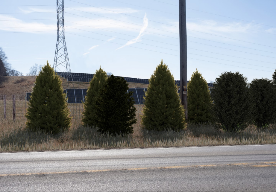
VP-05 | Proposed - Five Years after Planting