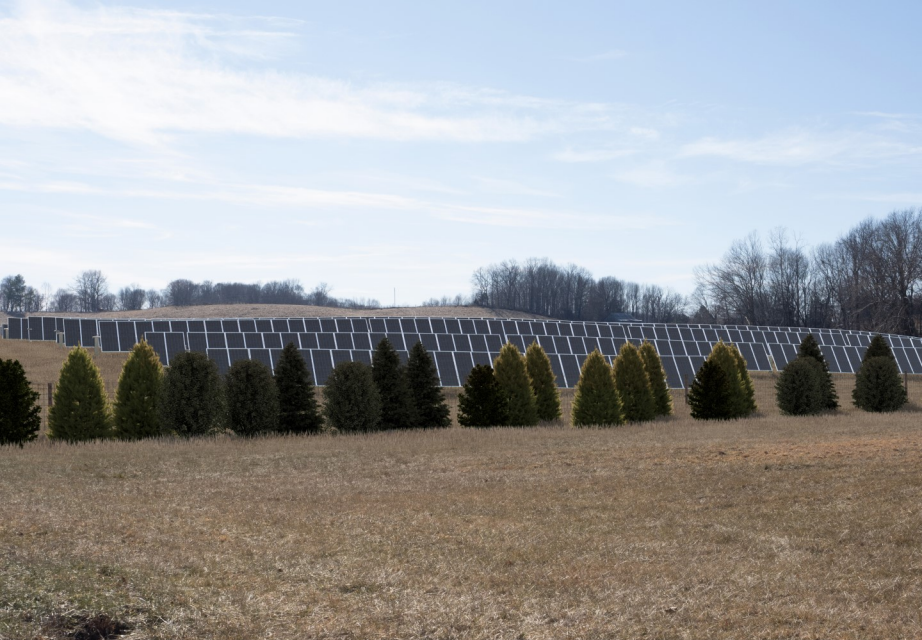
VP-07 | Proposed - Five Years after Planting