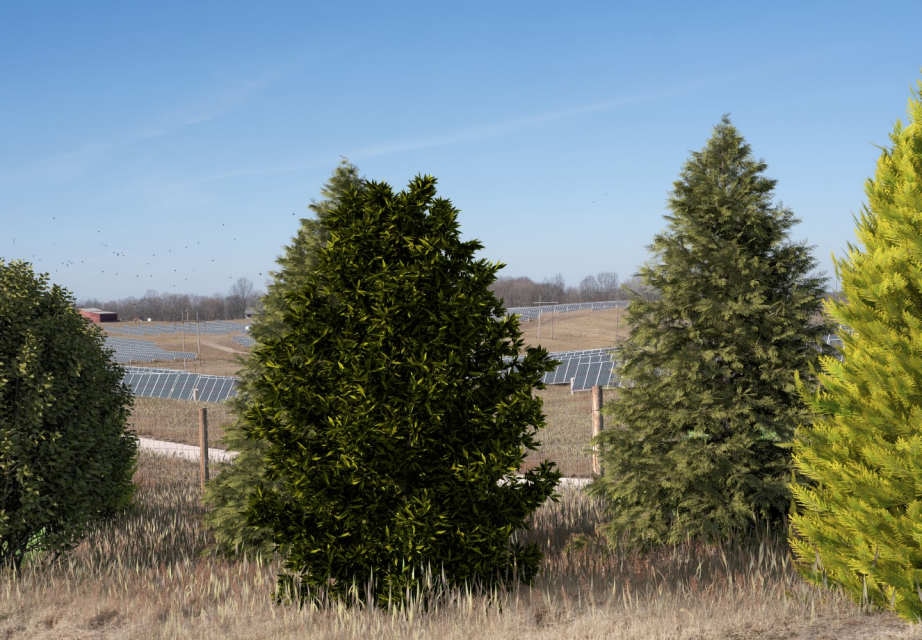
VP-06b | Proposed - Five Years after Planting