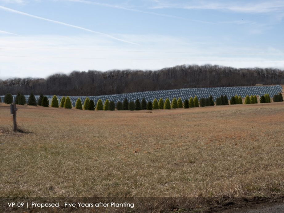
VP-09 | Proposed - Five Years after Planting