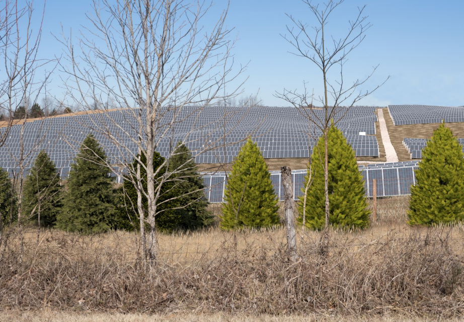
VP-10 | Proposed - Five Years after Planting