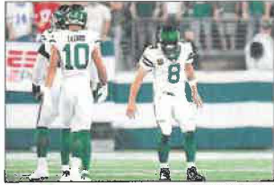
New York Jets quarterback Aaron Rodgers (8) limps after a sack during the first half of an NFL football game against the Buffalo Bills on Sept. 11, 2023, in East Rutherford, N.J. Being able to navigate through injuries to key players could make all the difference between a team seeing its season sink or beating the odds and making the playoffs.

A concussion is a brain injury caused by a hit to the head or a sudden movement that causes the head and brain to shake violently. Symptoms may include headaches, neck pain, nausea, dizziness and