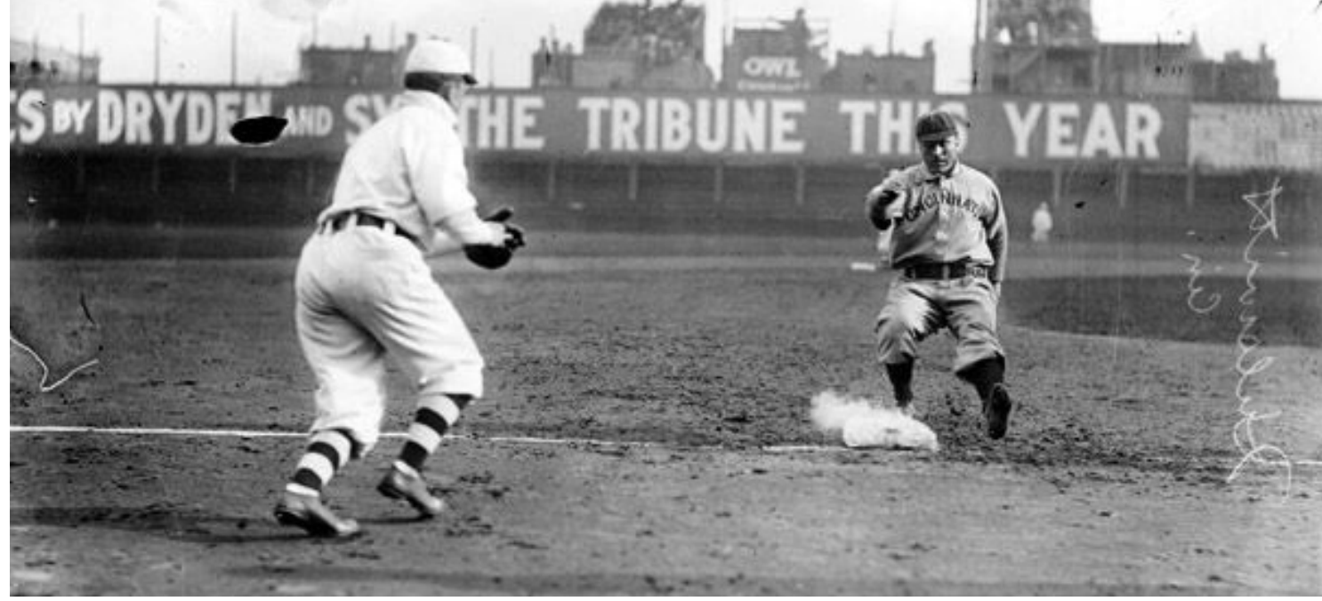
The Reds' Rudy Hulswitt, right, beats a Cubs fielder to the bag in a 1908 game at West Side Grounds in Chicago.

According to the New York Times, Baldwin was a "hopeless wreck from dissipation."