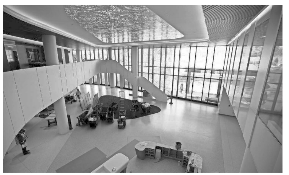
The main lobby of St. Elizabeth Edgewood Hospital. St. Elizabeth had the strongest profit margins of any adult health system in Greater Cincinnati in 2023.