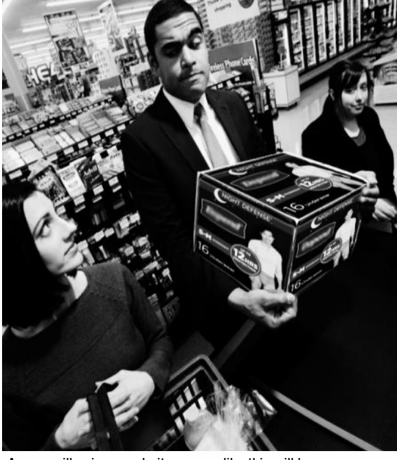
As new pill gains popularity, scenes like this will become rare and unusual.

The secret is its ability to inhibit 5-alpha-reductase (the enzyme that causes bladder overactivity). BladderMax's active ingredient helps calm and increase urine flow so your bladder doesn't have the constant need to empty. Then, it strengthens bladder tissue to help the blad-