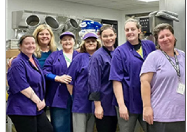
Jackson Independent nutrition professionals.

The Nutrition Team will be recognized by