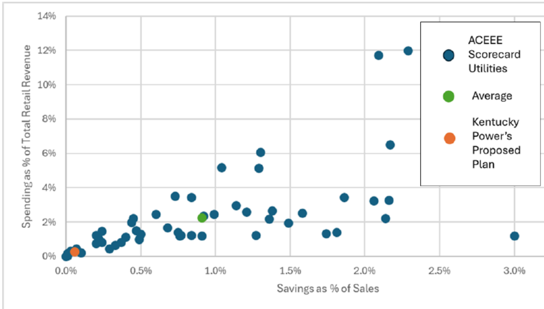
Revised Figure 1. Comparison of Utilities' Investment in Energy Efficiency based upon Revenues and Energy Sales

A revised version of Ms. Sherwood's testimony, with corrected Figure 1, is attached. For added reference, the two figures, Revised Figure 1 and the original, are reproduced below.