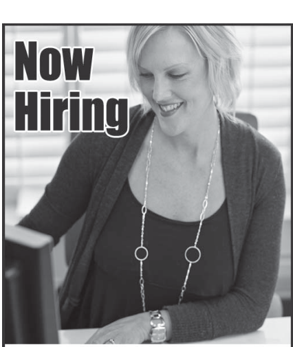
Now Taking Applications for