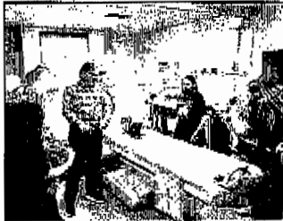
Pictures above are Morgan County Middle School Career Mentoring+ students and mentors.