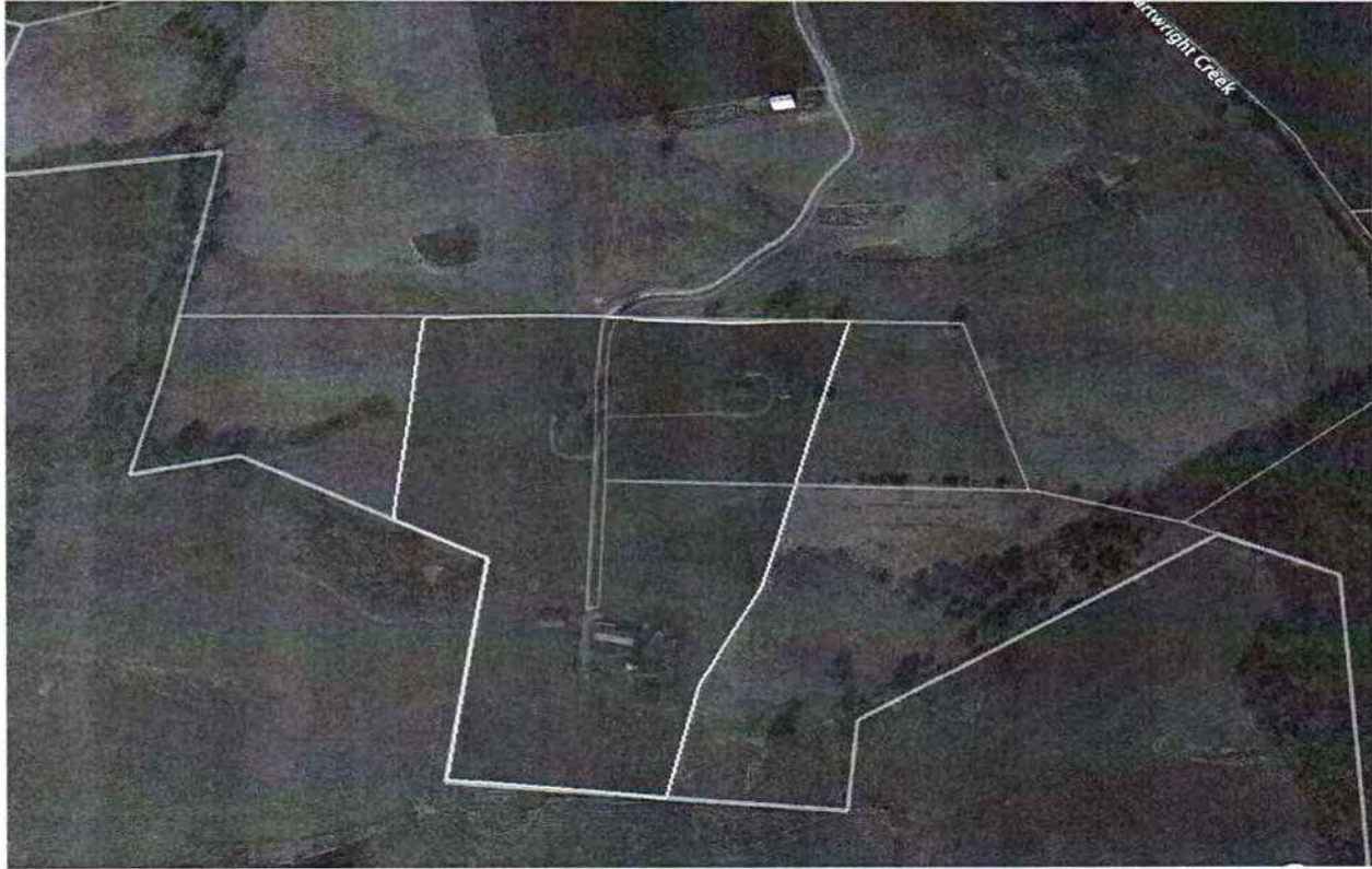
Exhibit A-1 Do Not Disturb Area