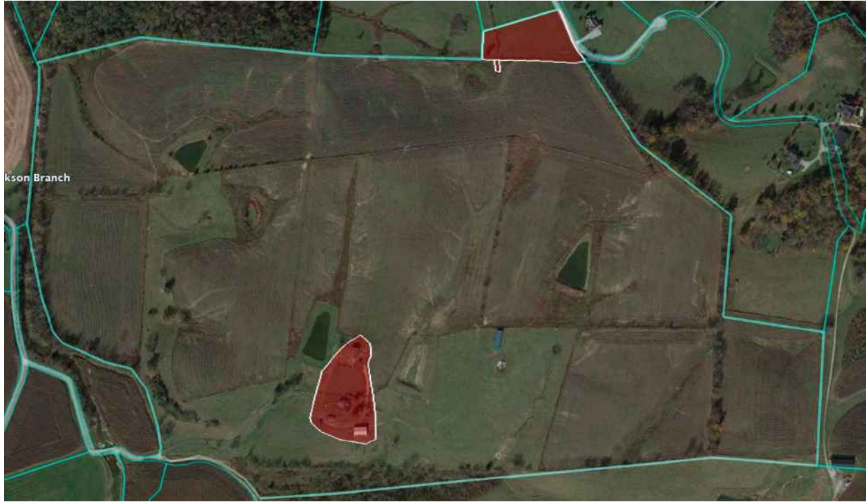
Exhibit A-1 Do Not Disturb Area