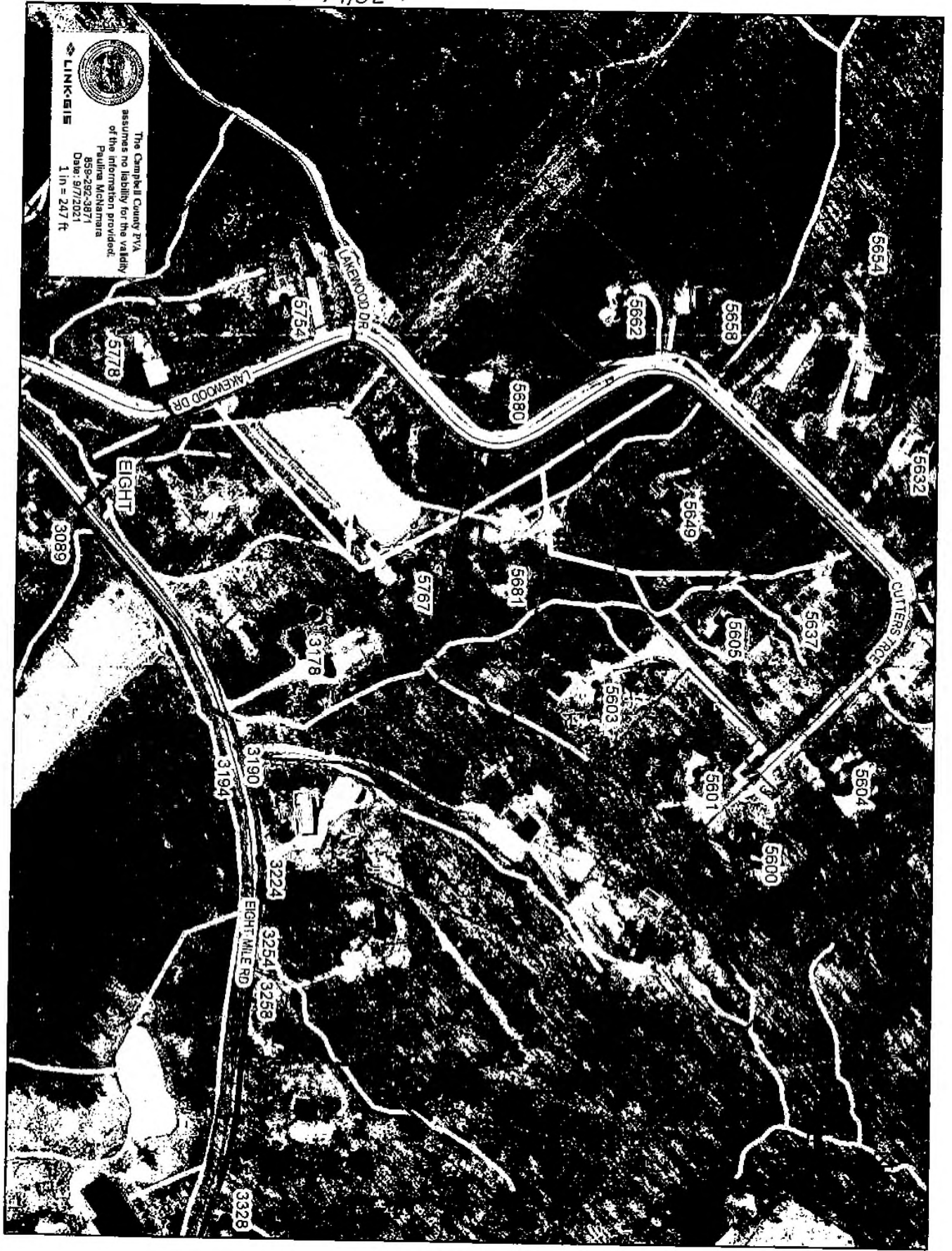
EXHIBIT AL PAGE 1

Case No. 2023-00181 Application Exhibit 6 Page 16 of 24