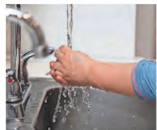
Use a song to make washing hands more enjoyable for kids.

Balster: If my child were at a higher risk for severe illness and I were aware of a significant rise of respiratory illness within the school, then yes. However, overall hygiene plays just as significant of a role in the spread of respiratory diseases.