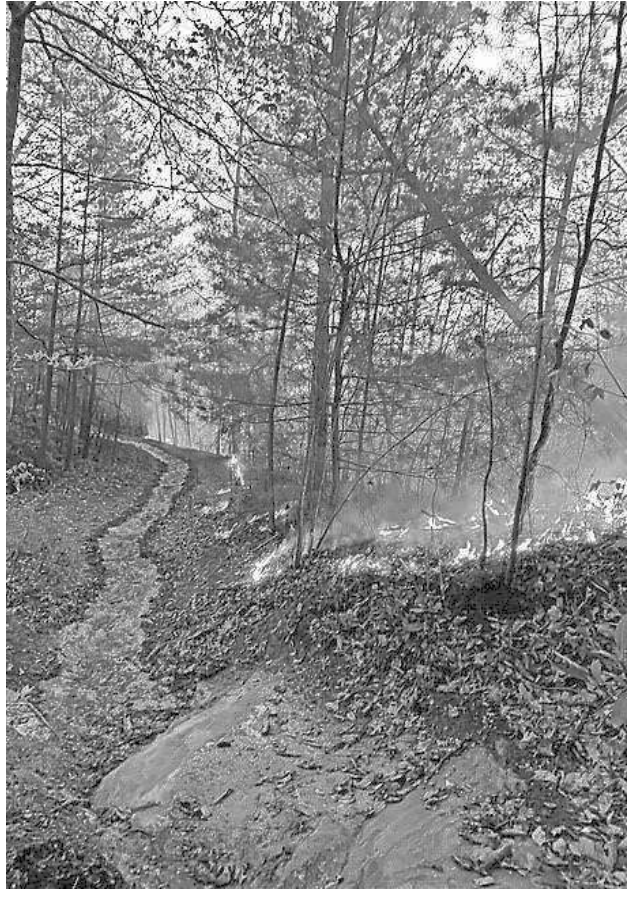
The wildfire started April 17, Kentucky's Division of Forestry said Monday.