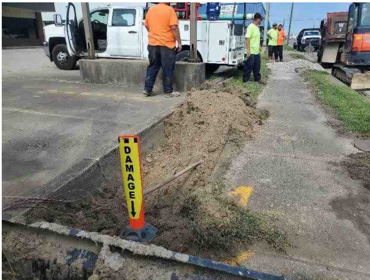
Property of United States Infrastructure Corporation Photo created on 08/26/2022 10:58:45 AM EDT