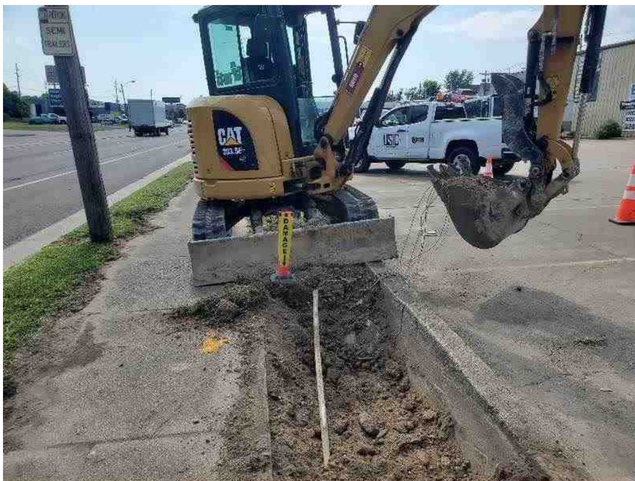
Property of United States Infrastructure Corporation Photo created on 08/26/2022 10:58:33 AM EDT