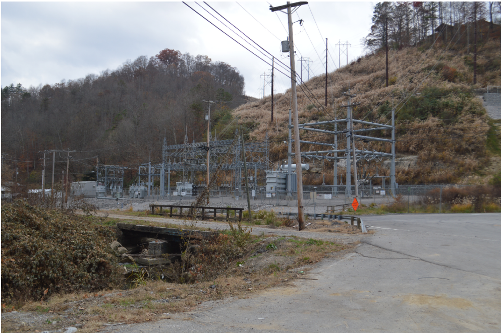
Bonnyman Substation on Typo Road