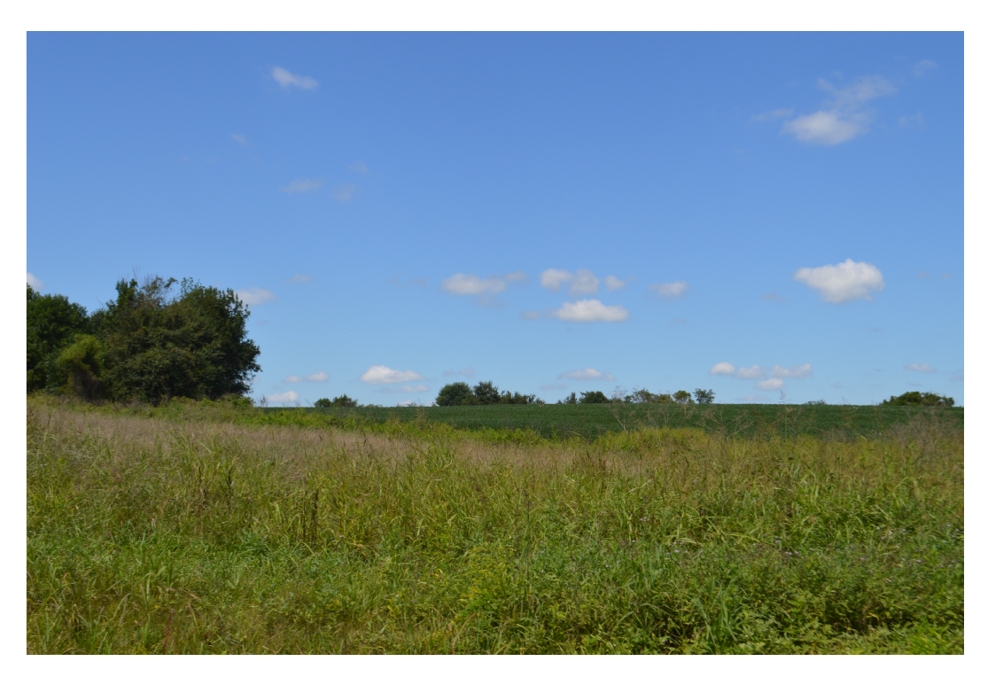
Exhibit B-22. Intersection of Kilbreth Valley Rd and Poplar Grove Road, Facing Proposed Meteorological Station, near Proposed Construction Entrance