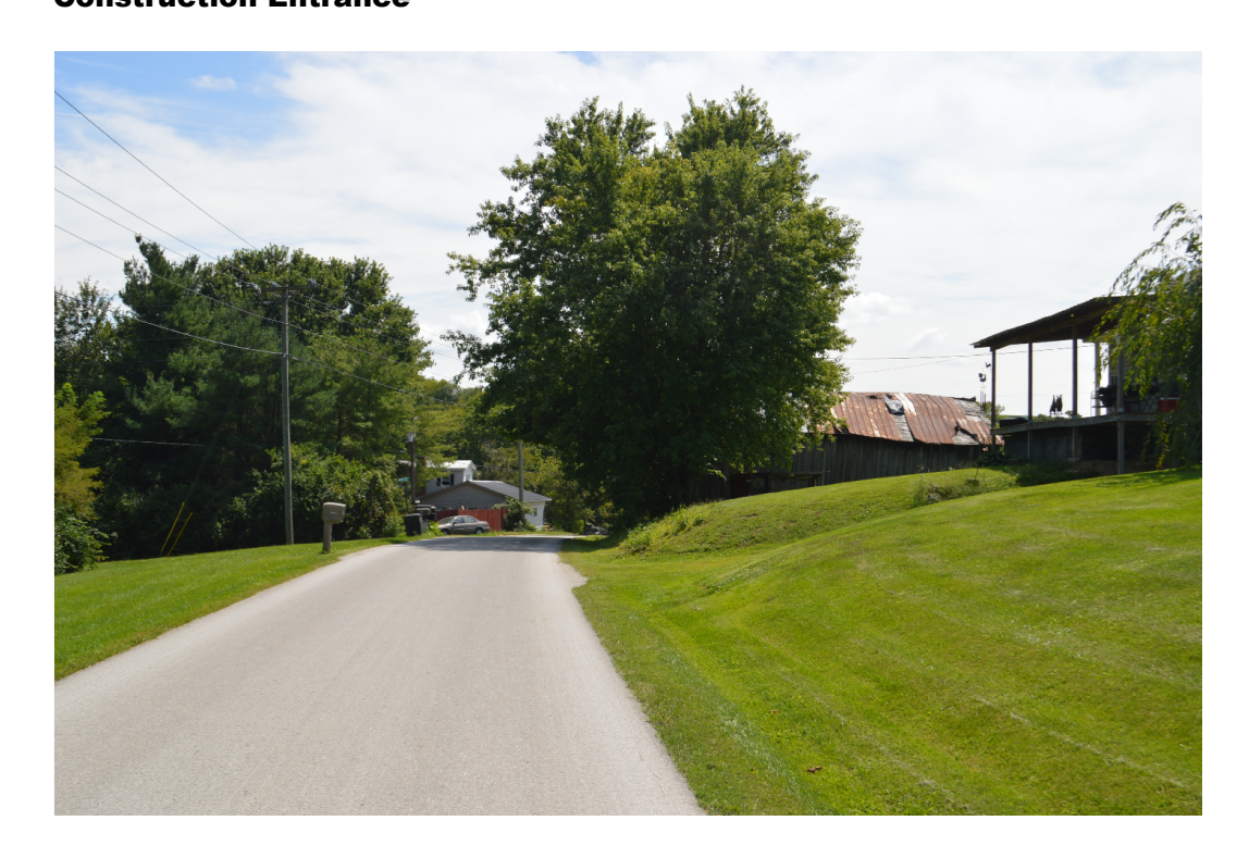
Exhibit B-26. View from Mt Carmel Cemetery, Facing West towards Panels