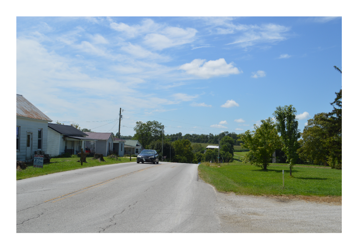
Exhibit B-29. View from Mt Carmel Fire Department, on Foxport Rd