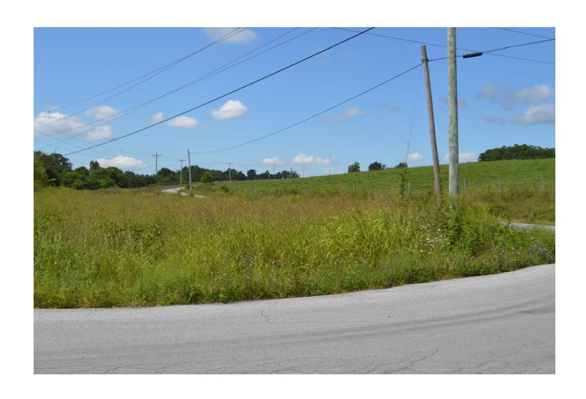
Exhibit B-24. Poplar Grove Rd, Facing Panels near Proposed Construction Entrance