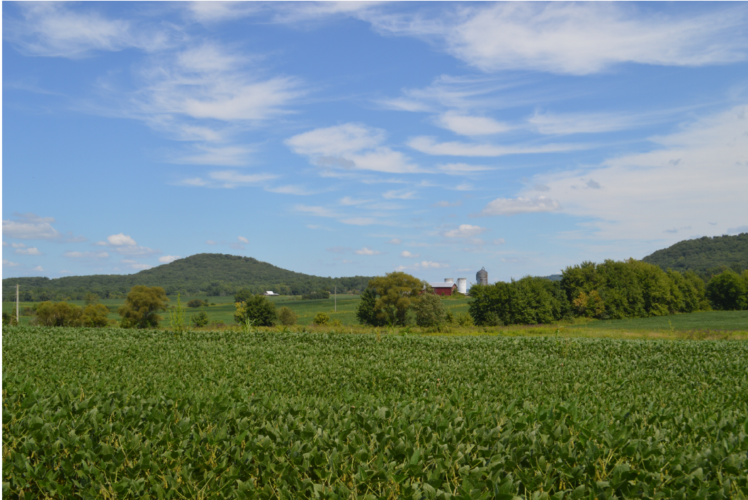
Exhibit B-32. Black Diamond Road, near Proposed Construction Entrance