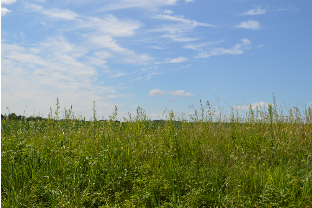
Exhibit B-33. Black Diamond Rd at Carpenter Lane, view of Proposed Construction Entrance and Substation