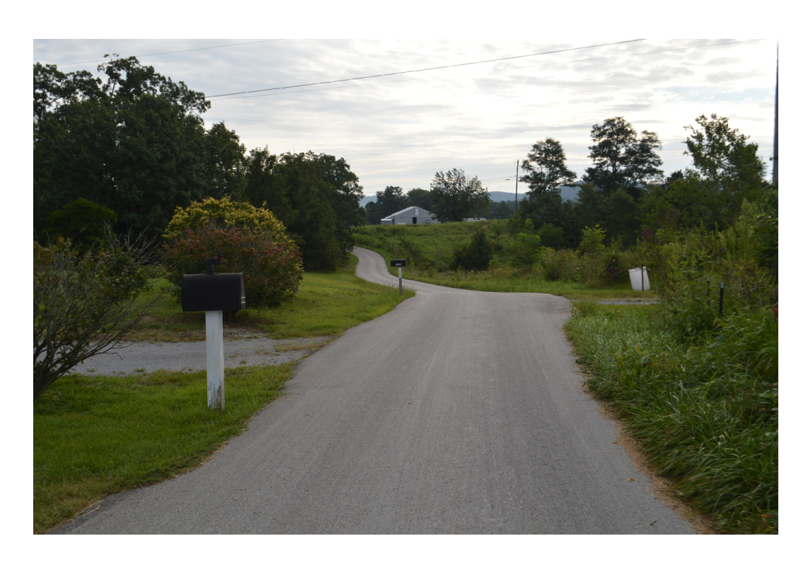
Exhibit B-7. Foxport Cemetery & Adjacent Property, Facing West