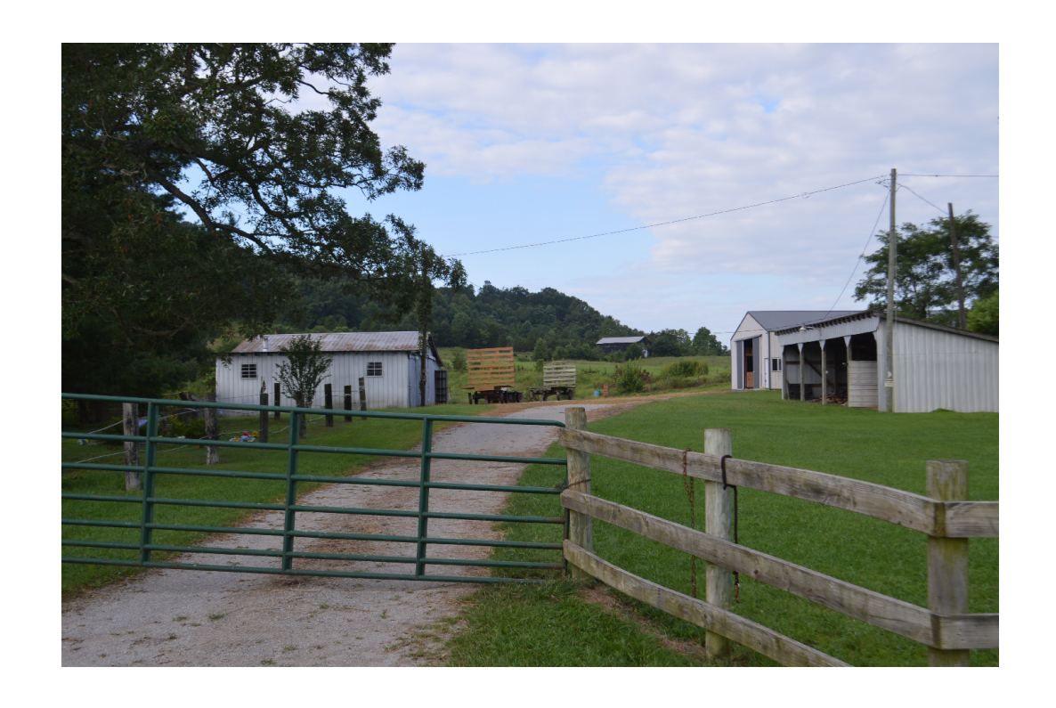
Exhibit B-8. Foxport Neighborhood, near Intersection with Black Diamond Rd