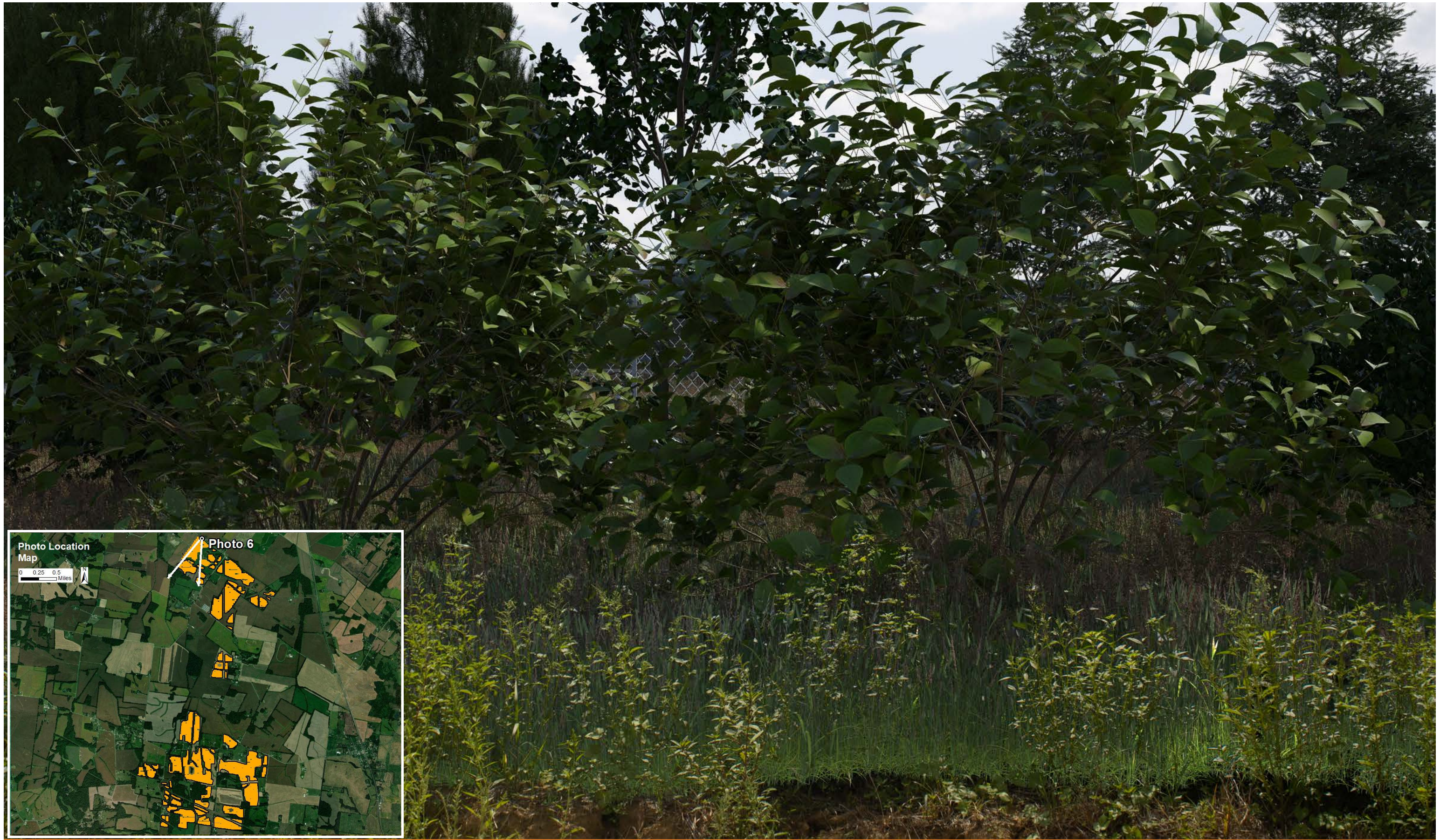
Photo 6- Meahl Cates Rd SIMULATED CONDITION WITH LANDSCAPE MITIGATION - YEAR 5 GROWTH