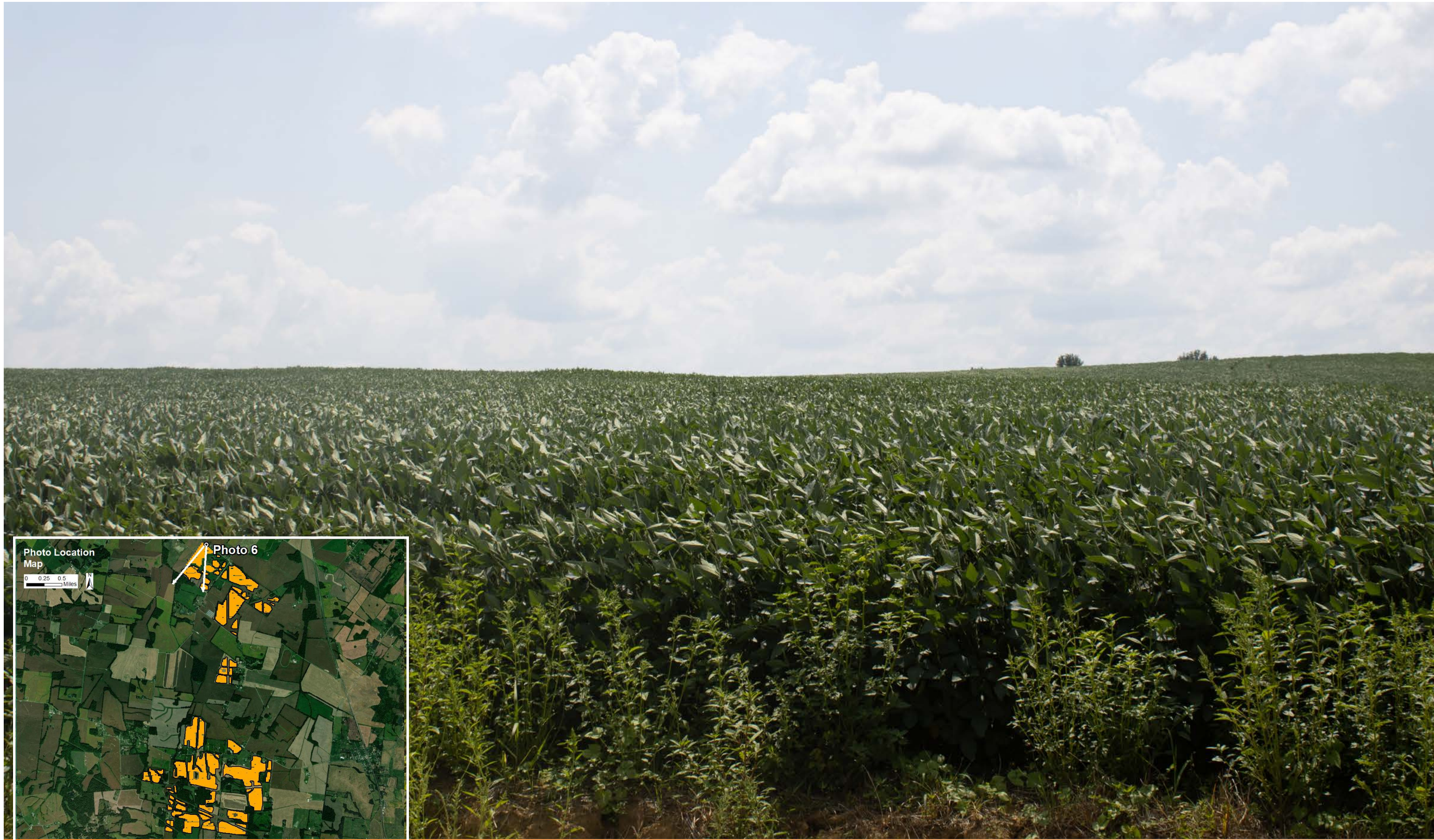
Photo 6- Meahl Cates Rd EXISTING CONDITION