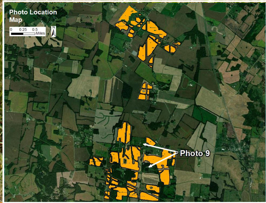
Photo 9 - Spencer Thornberry Rd near KY-416 EXISTING CONDITION