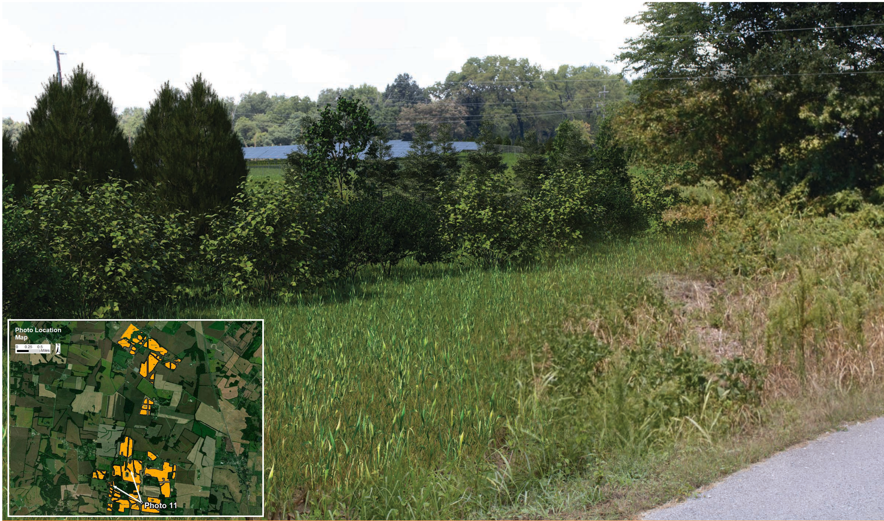
Photo 11- WN Royster Rd SIMULATED CONDITION WITH LANDSCAPE MITIGATION - YEAR 5 GROWTH