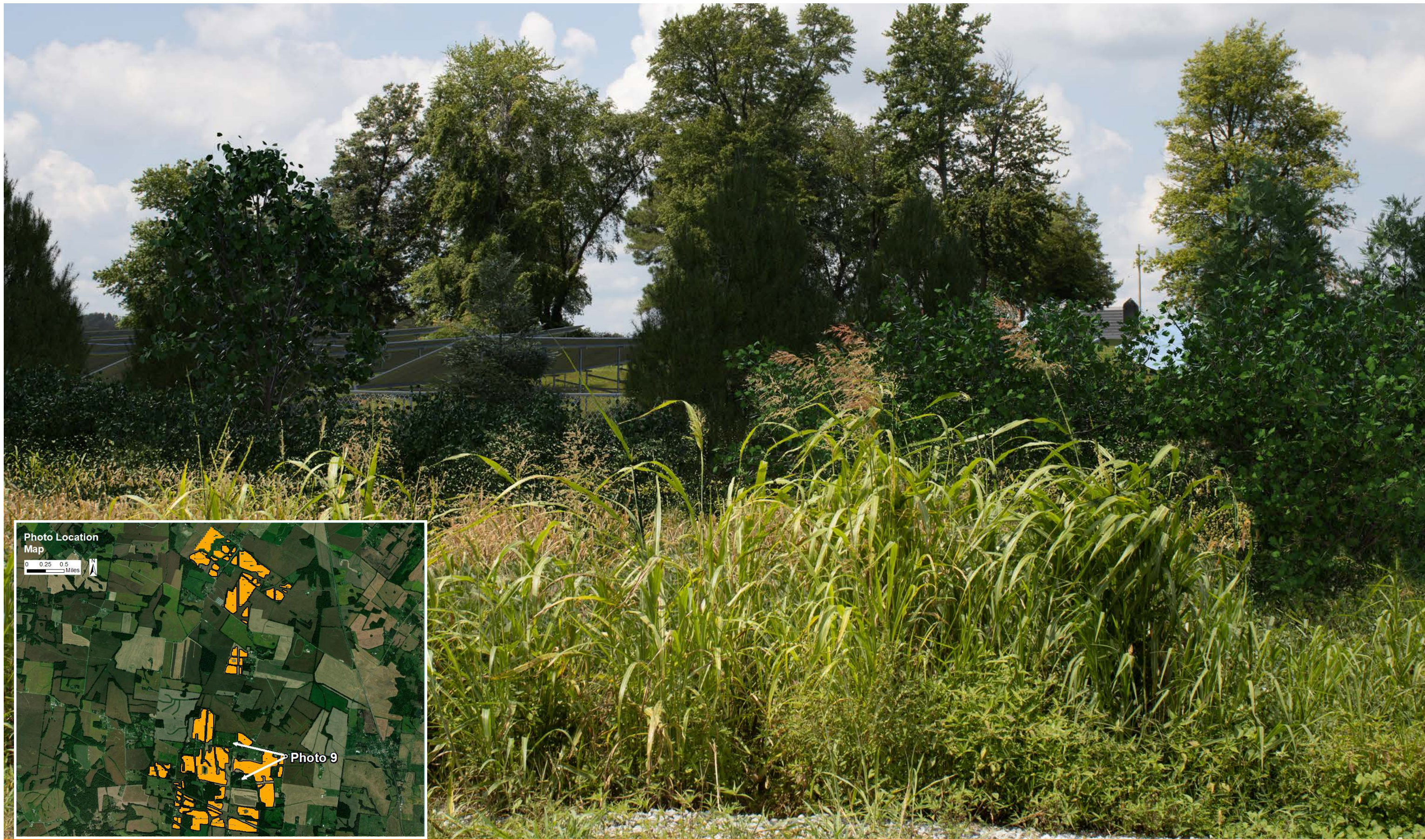
Photo 9 - Spencer Thornberry Rd near KY-416 SIMULATED CONDITION WITH LANDSCAPE MITIGATION - YEAR 5 GROWTH