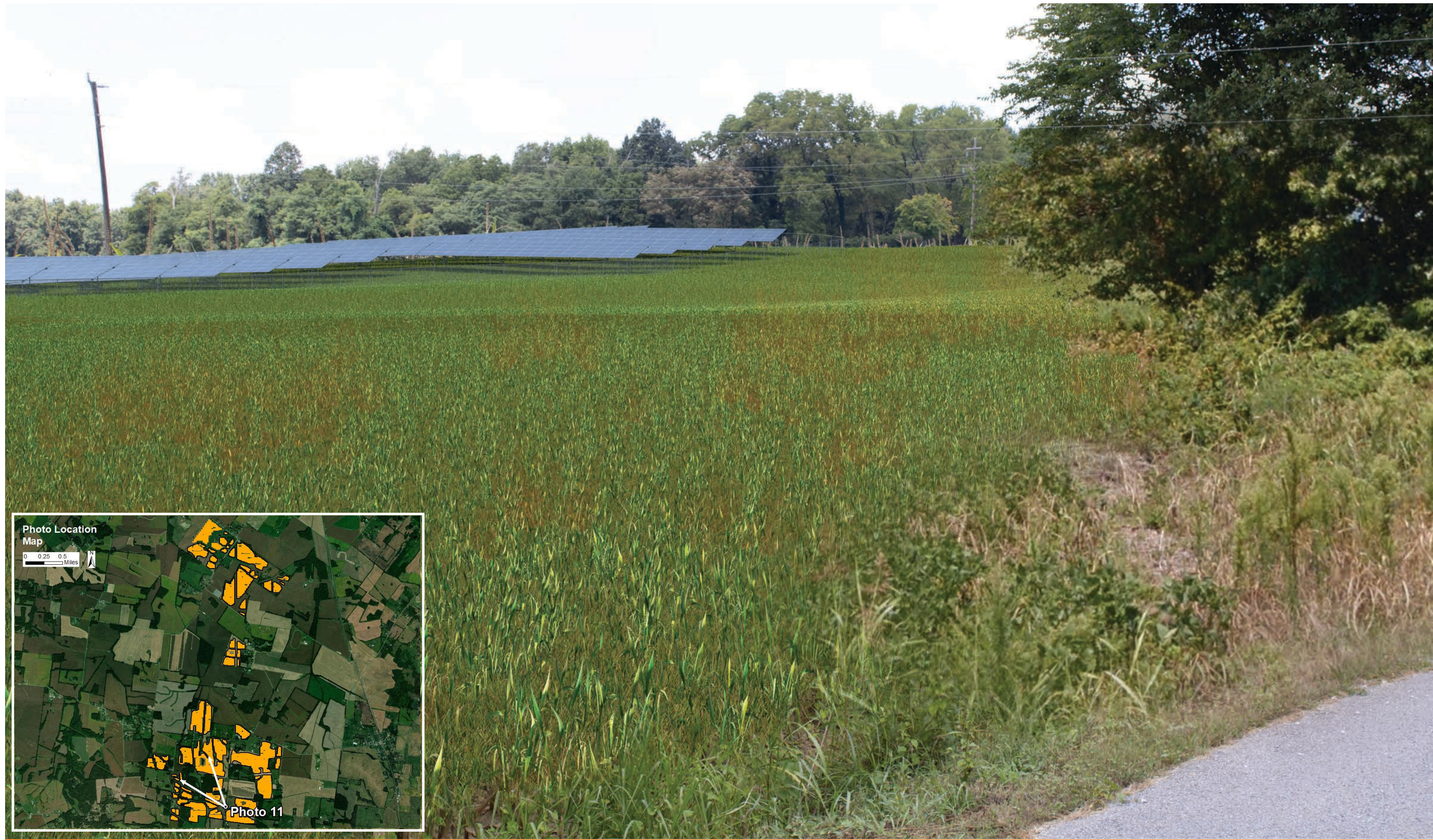
Photo 11- WN Royster Rd SIMULATED CONDITION