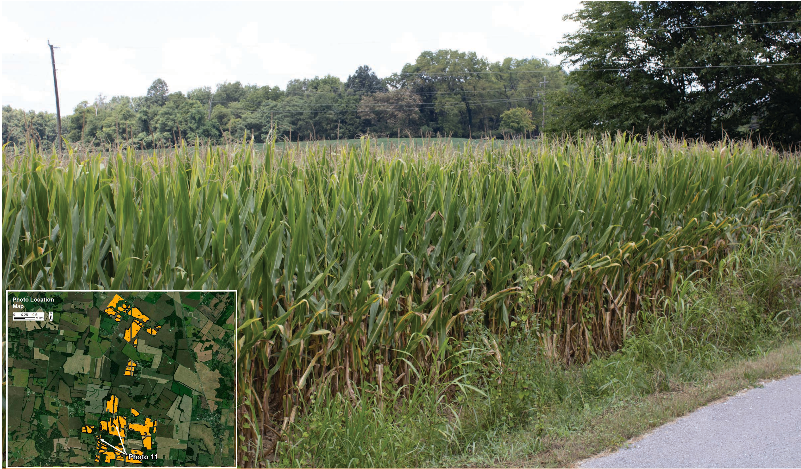
Photo 11- WN Royster Rd EXISTING CONDITION