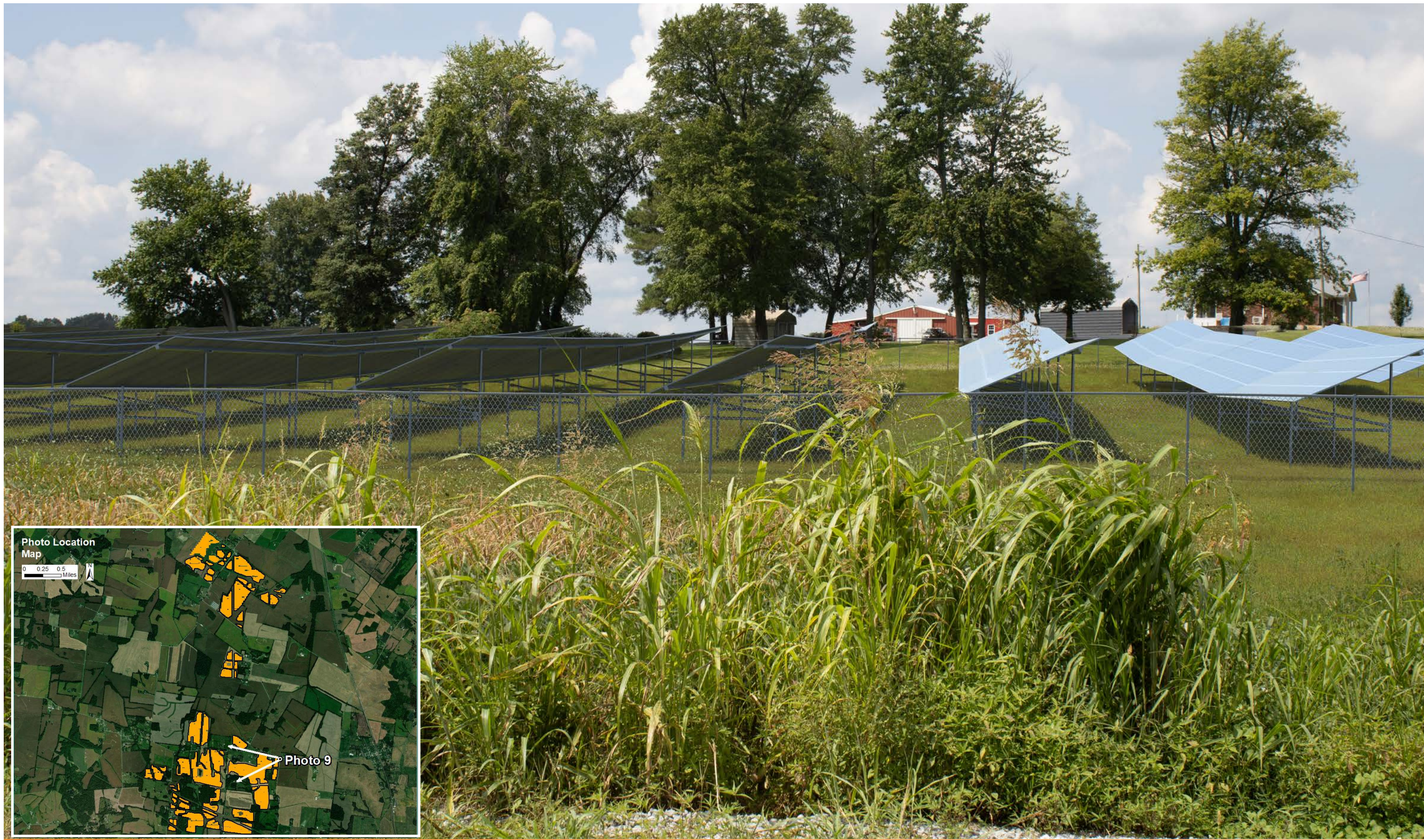
Photo 9 - Spencer Thornberry Rd near KY-416 SIMULATED CONDITION