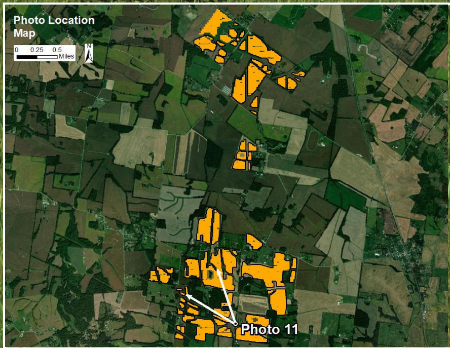
Photo 11- WN Royster Rd SIMULATED CONDITION WITH LANDSCAPE MITIGATION - YEAR 1 GROWTH