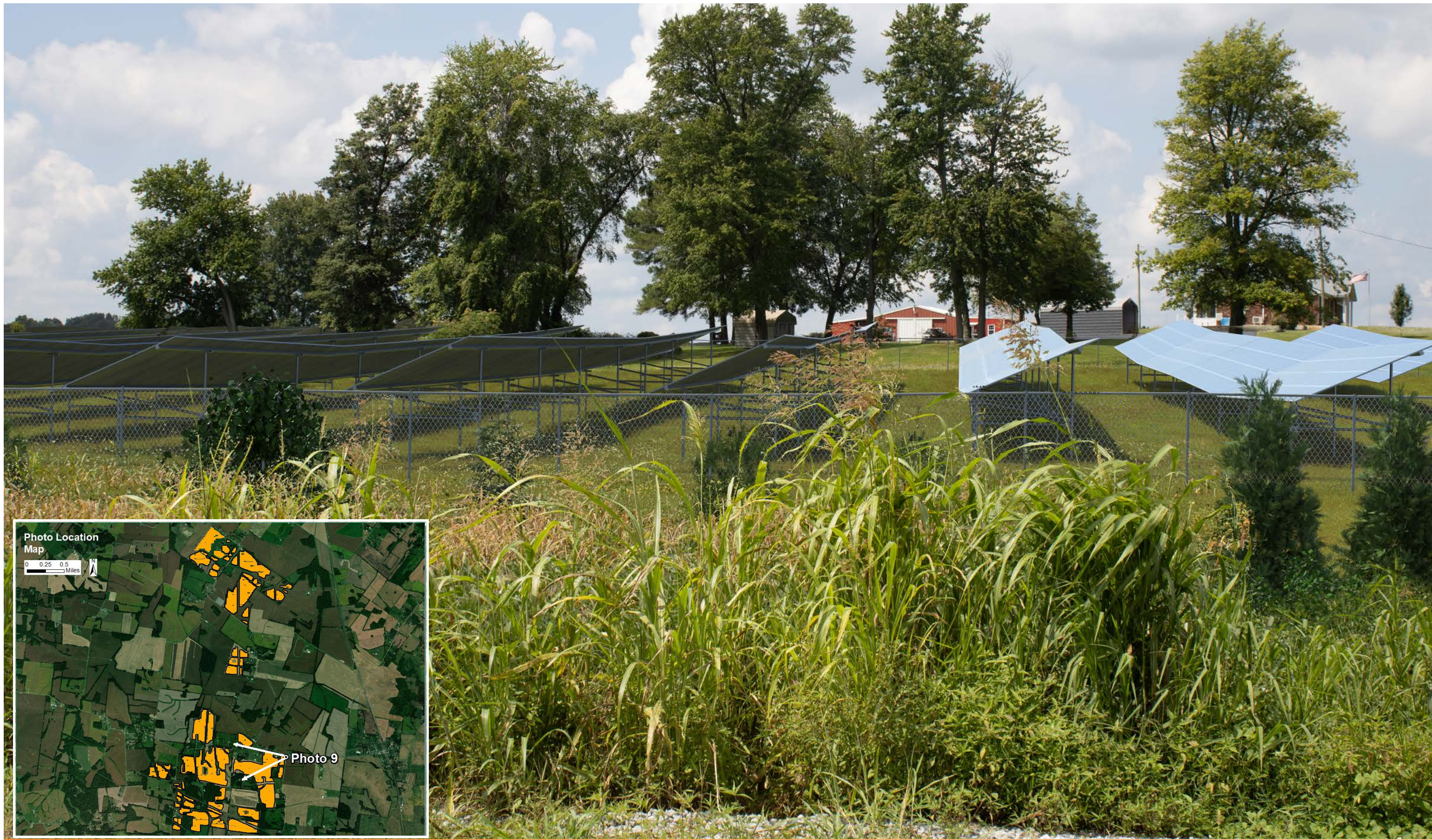
Photo 9 - Spencer Thornberry Rd near KY-416 SIMULATED CONDITION WITH LANDSCAPE MITIGATION - YEAR 1 GROWTH