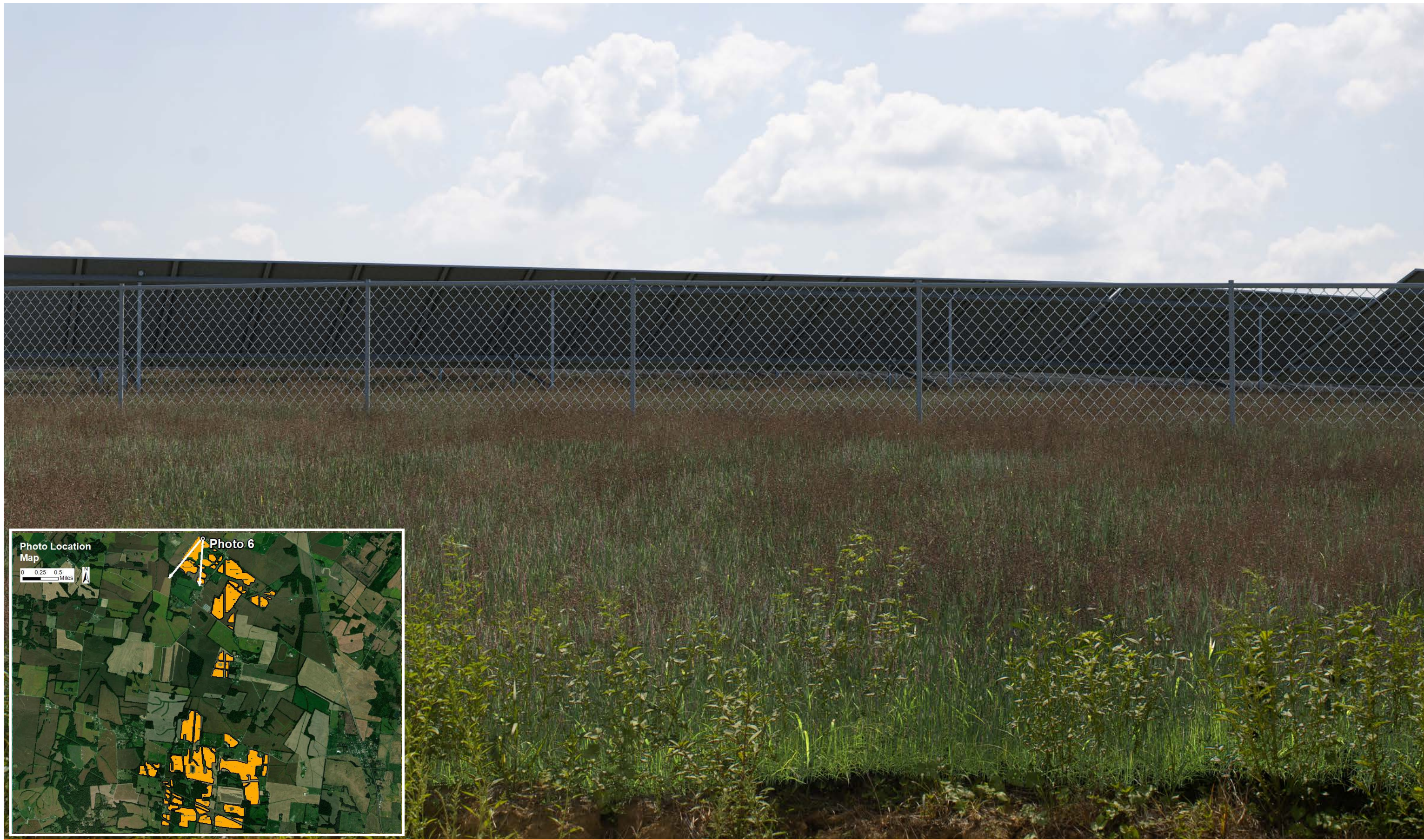
Photo 6- Meahl Cates Rd SIMULATED CONDITION