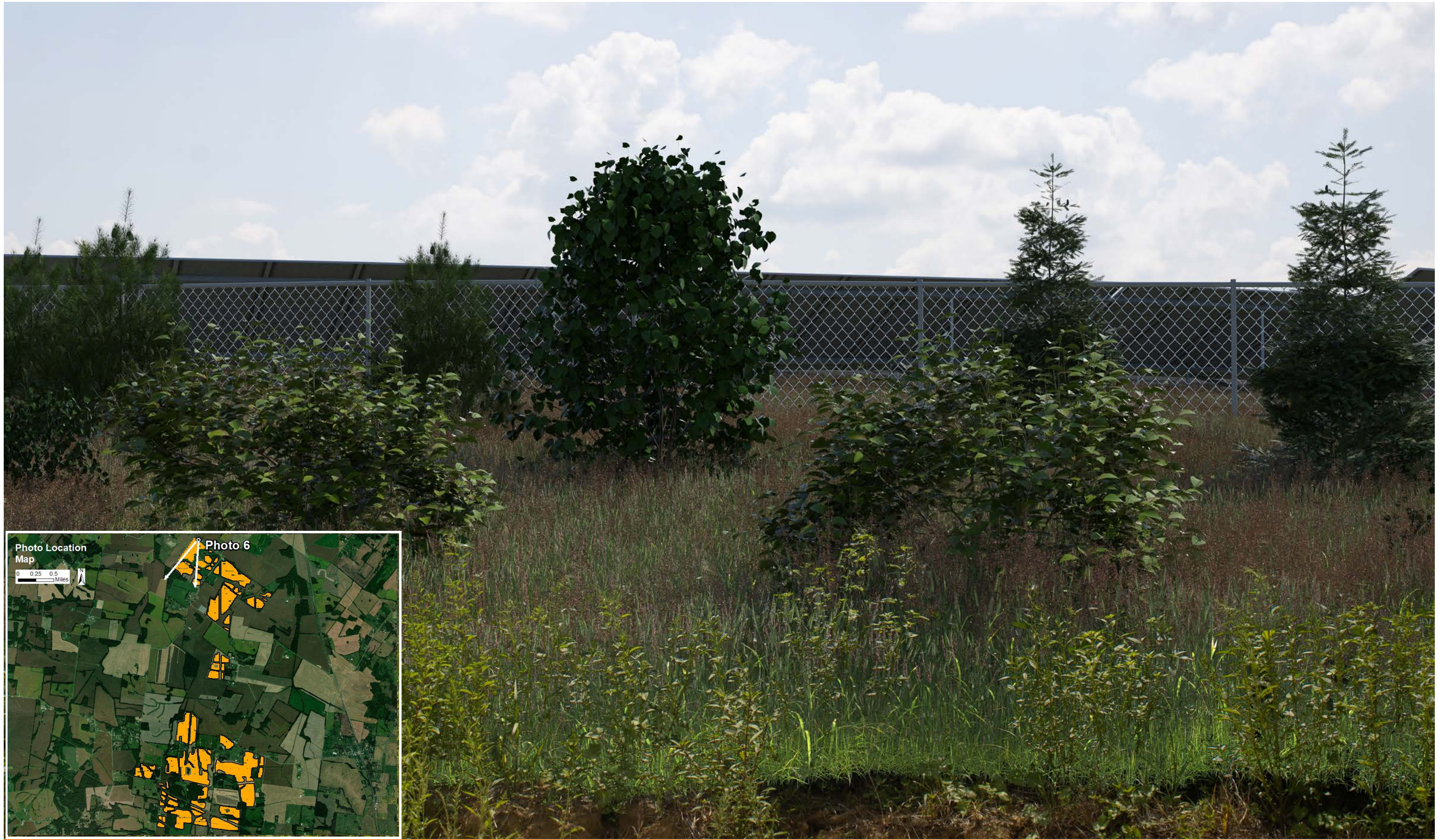
Photo 6- Meahl Cates Rd SIMULATED CONDITION WITH LANDSCAPE MITIGATION - YEAR 1 GROWTH