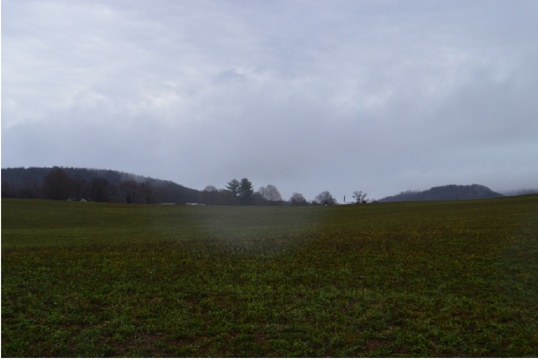
Exhibit B-7. Kingdom Hall of Jehovah's Witness, on KY-335