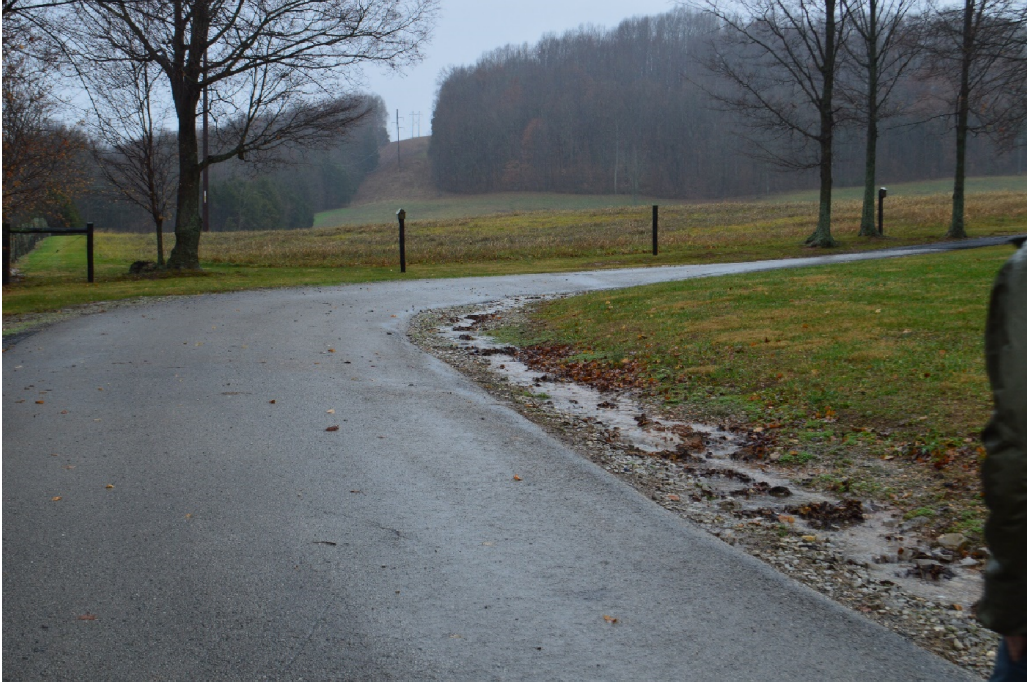
Exhibit B-4. Residence at the end of Johns Lane, near Proposed Substation/Switchyard (Non-Participating Landowner)