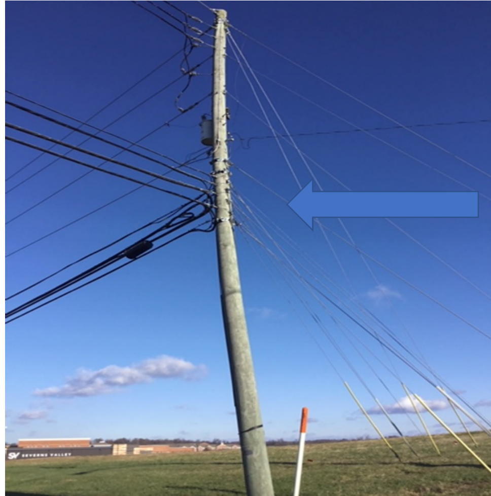
Pole bowed at attachment