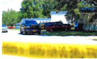
Clermont County sheriff's deputies investigate the scene where two men were found dead at a New Richmond mobile home park Thursday.

Amelia, was charged last week with tampering with evidence after he admitted to taking a shoe and a head covering from the mobile home where the two men were found shot dead Thursday.