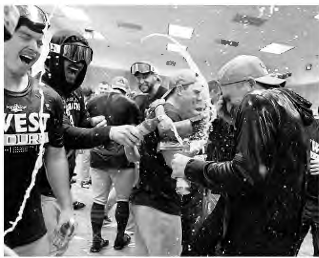
The Los Angeles Dodgers celebrate after beating Arizona to clinch the National League West on Tuesday.

— I learned (by doing it wrong, obviously) the importance of picking the right people to talk to about it. I had people totally blow it off or make thoughtless comments, which made me feel worse-er. I wish I'd chosen based on their own emotional makeup.