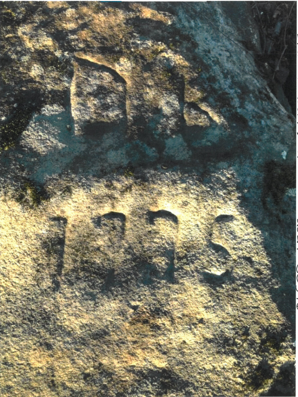
EXHIBIT (No. 1) CASE No. 2021-00346