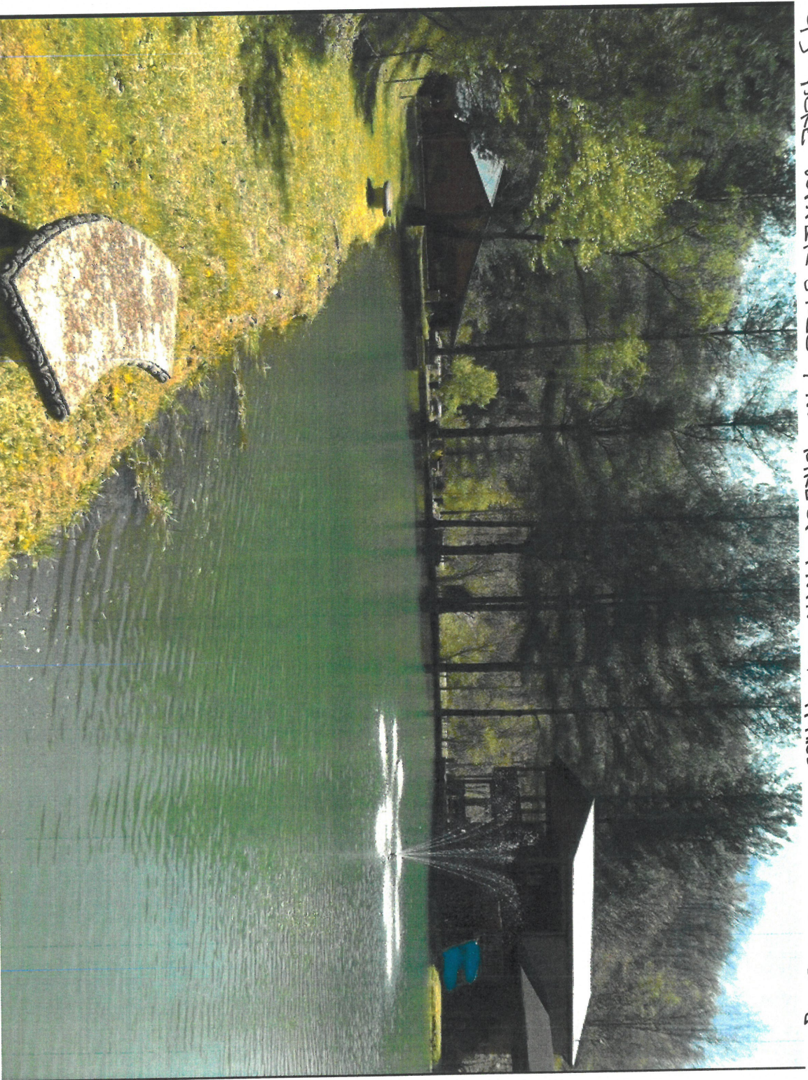
EXHIBIT (NO. 2) (CASE NO. 2021-00346) LOWER POND W/ 2 HOMES

"95" ACRE WATER SHED | IN DIRECT PATH OF "TRANSMISSION LINES" ↓