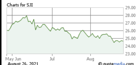
Chart for SJI