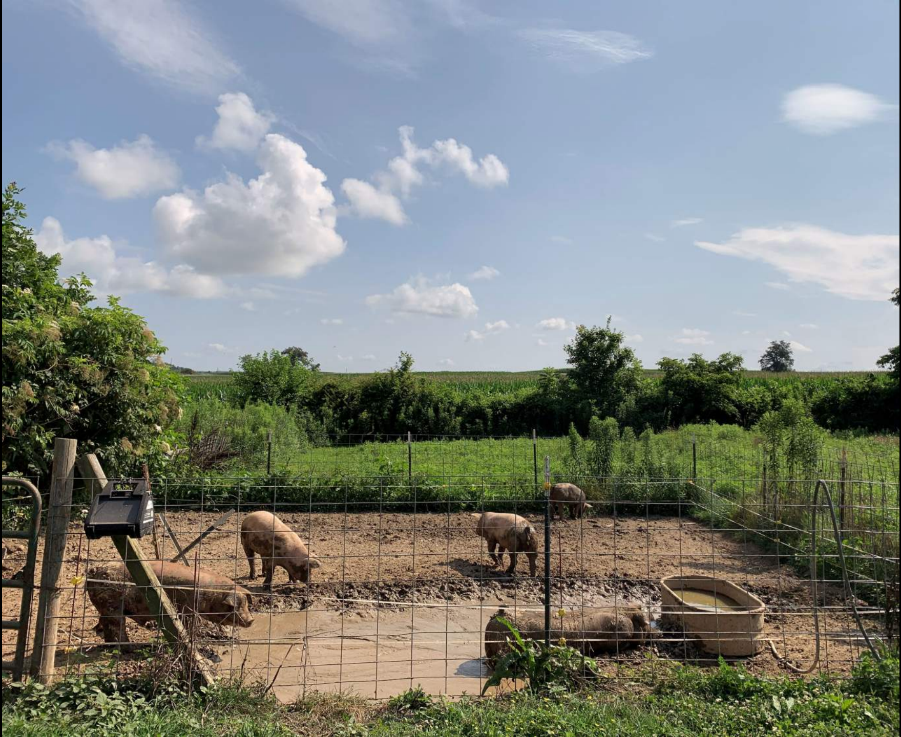
TUCKERS RESIDENCE – EXISTING PHOTO