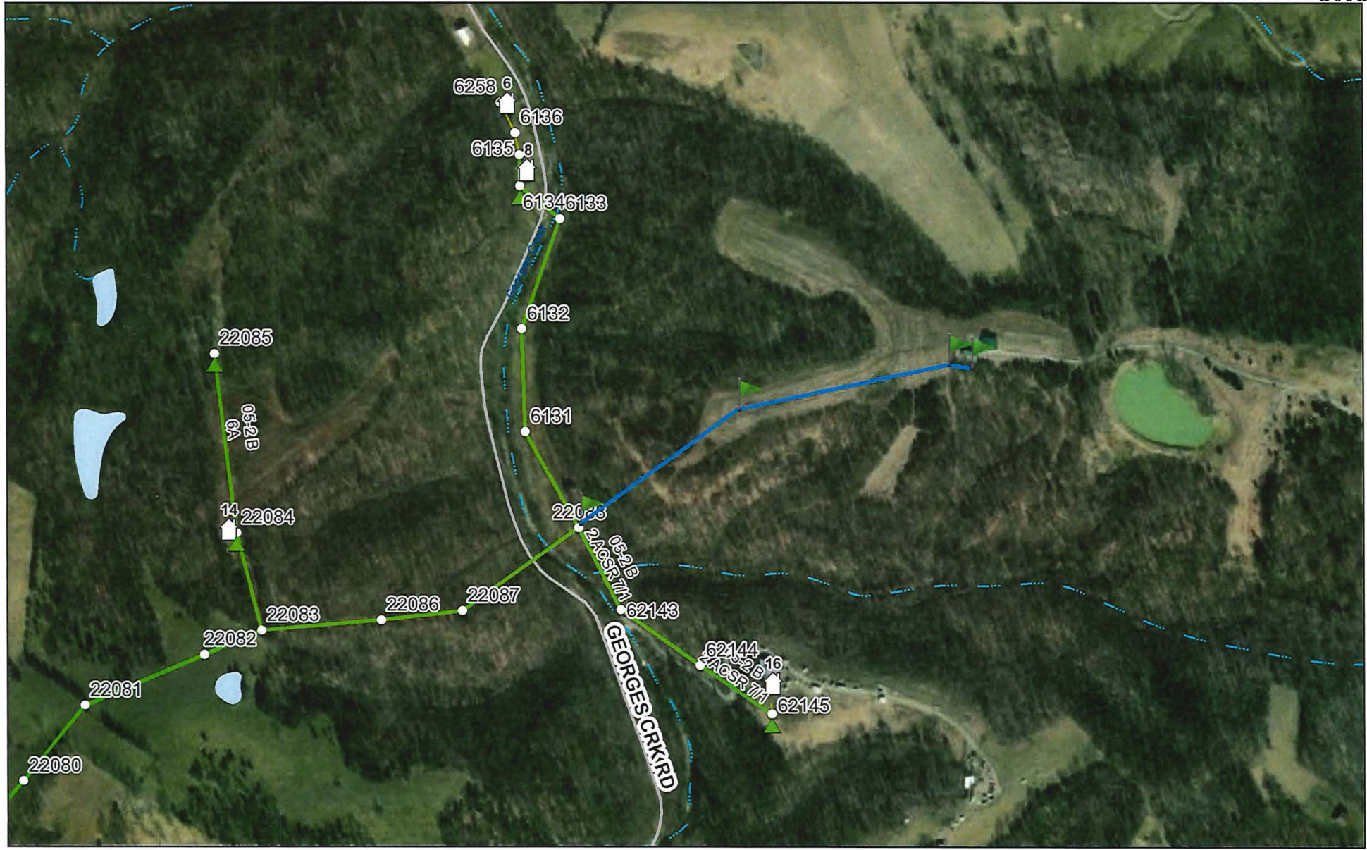
April 1, 2021