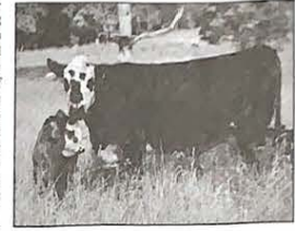
Newborn calves are a common sight this time of year in Kentucky pastures.