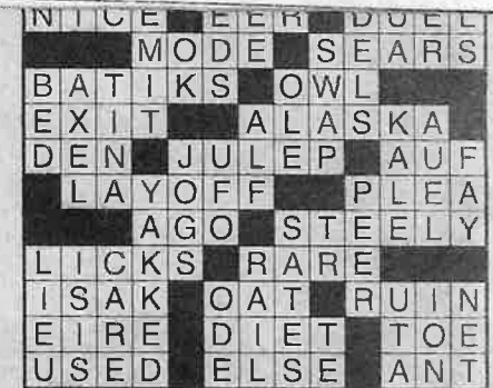
7-21-21 © 2021 UFS, Dist. by Andrews McMeel for UFS