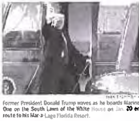
Former President Donald Trump waves as he boards Marine One on the South Lawn of the White House on Jan. 20 en route to his Mar-a-Lago Florida Resort.

The Democratic legal team, tracing his efforts to undermine democracy to when he first laid out his agenda in the summer he would not ac-