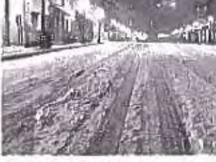
ABOVE: A photo makes its way along Franklin Street during a snowstorm early Sunday morning.