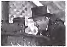
NOVEMBER 1, 2020 Grounding of a President left only one path with Donald Trump: He, the weather dogged and the groundhog, dug the 13th celebration of Groundhog Day on Tuesday in Pennsylvania, Pa.