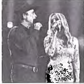
Clint Black performs a duet with his wife, Lisa Hartman-Black.