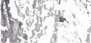
BELOW: A cardinal snacking from a feeder on Sunday after the region received a 7 inches of snow.