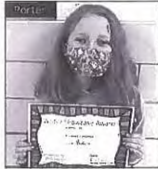
Fifth grade writing contest

With the right tools and mindset, every student can have a strong spring semester.