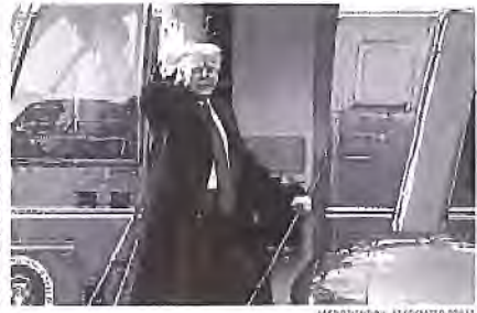
President Donald Trump was set to be Donald Trump's 75th birthday party on Jan. 20 on the grounds of the White House in a ceremony to be held on the lawn.

The report accused his associates of sowing chaos and terrorism, and it accused Trump of trying to "steal back and stand by" a September debate — where he had implied he would have been prime for the presidency. "Trump's actions were aimed at intimidating his followers, and they were aimed at intimidating the First Amendment in this country," the report said. "It is not in our interest to let Trump continue to do this."