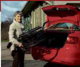
Easy to Transport and Store

Mention CODE 50FEATHER to start your journey towards effortless mobility.