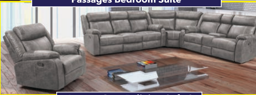
Jarama Grey Relining Sofa & Console Reclining Love Seat