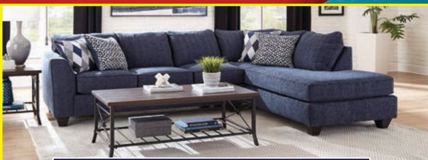
Endurance Denim Sectional