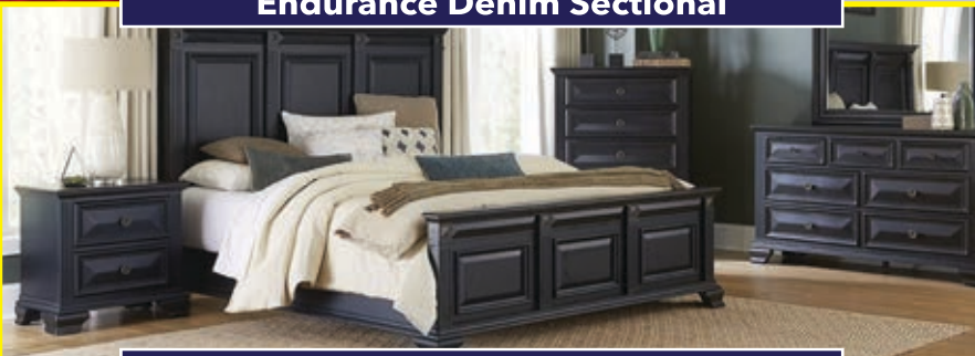
Passages Bedroom Suite