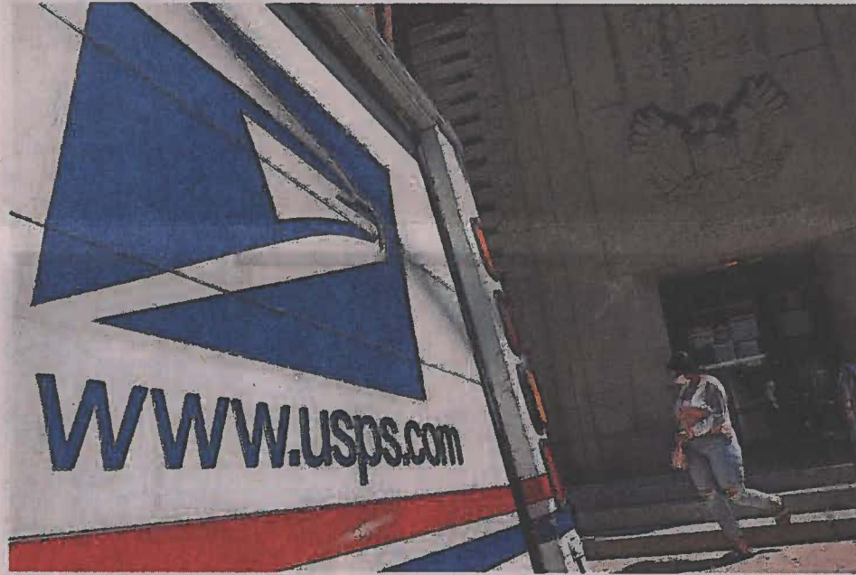
A postal vehicle sits in front of a U.S. Postal Service facility on Aug. 13 in Chicago.

Any corporation, association, body politic or person may by motion within thirty (30) days after publication or mailing of notice of the proposed rate changes, submit a written request to intervene to the Public Service Commission, 211 Sower Boulevard, P.O. Box 615, Frankfort, Kentucky 40602, and shall set forth the grounds for the request including the status and interest of the party. The intervention may be granted beyond the thirty (30) day period for good cause shown. Written comments regarding the proposed rate may be submitted to the Public Service Commission by mail or through the Public Service Commission's website. A copy of this application filed with the Public Service Commission is available for public inspection at Duke Energy Kentucky's office at 1262 Cox Road, Erlanger, Kentucky 41018 and on its website at http://www.duke-energy.com . This filing and any other related documents can be found on the Public Service Commission's website at http://psc.ky.gov .