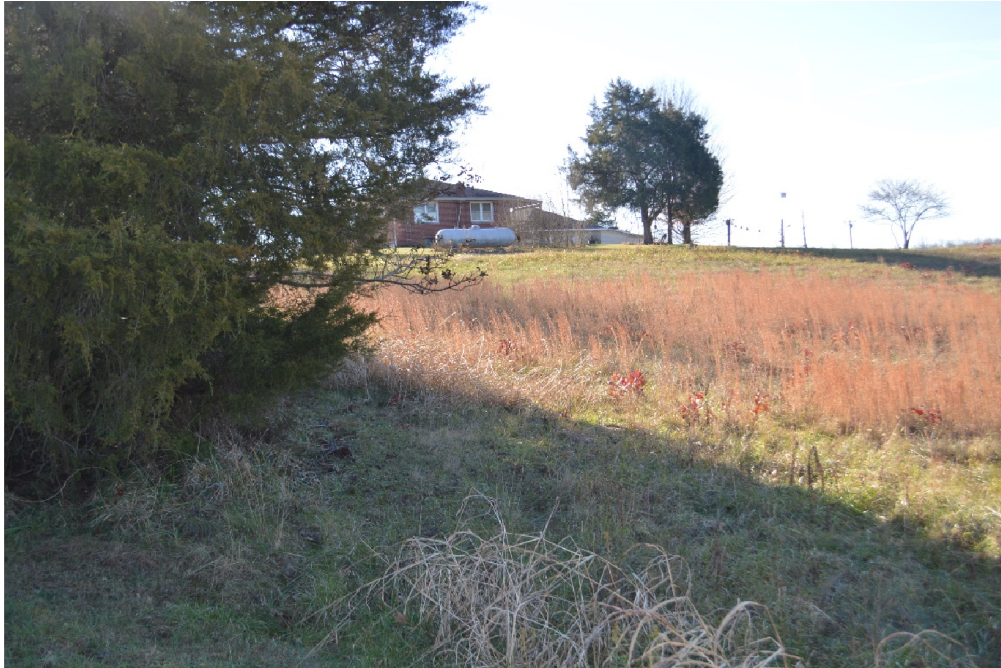
Exhibit B-5. Residences in Neighborhood along Old Fredonia Road, North of the Intersection with Bobby Gill Road (Residential Group 2)