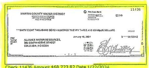
Check 11436 Amount $68,723.82 Date 1/22/2024