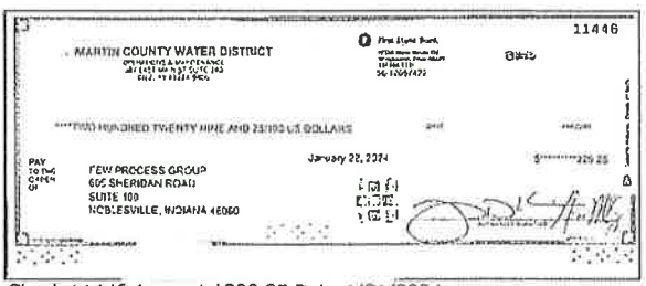
Check 11446 Amount $229.25 Date 1/31/2024