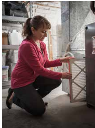
TOUCHSTONE ENERGY COOPERATIVE

You can do your part to get your system ready for summer by changing filters, cleaning leaves and other debris away from the outside unit, and installing a programmable thermostat that will automatically make the house cooler when everyone is in it and a little bit warmer during the day when the family is away.