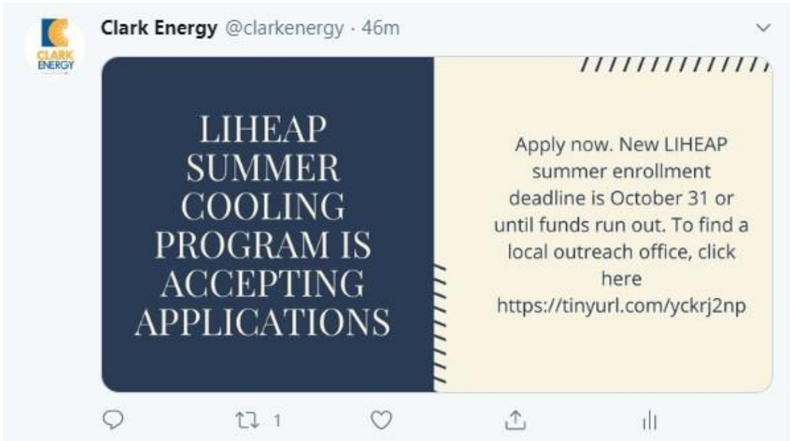
Twitter July 6, 2020