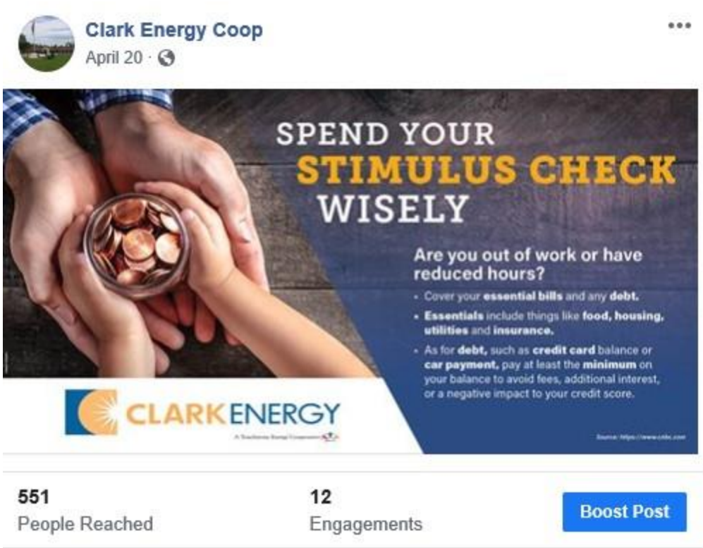
Facebook April 20, 2020