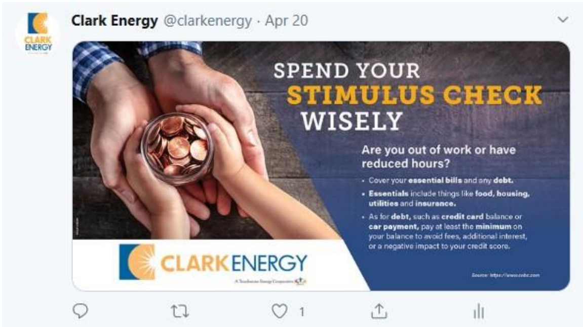
Twitter April 20, 2020