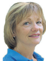
DEBORAH BRANCH NATURE NOTES

Progress does not understand that wetlands used by the copper belly are being altered by agriculture, roads, housing, flood control and other developments. Breaking the wetlands into small habitats and divided by roads interferes with the copper belly's migration pattern, because this snake will move from different wetlands as the water levels decrease in search of their food source. The snake is then more vulnerable to predators and hazards to crossing roads in search of another divided wetland. The Endanger Species Act is designed to help the Copper belly survive and avoid extinction by working with conservation groups and private landowners. The conservation measures also helps other wetland species such as frogs, turtles, ducks and other wildlife. The choices of today's careless action with pollution, tree removal as well as filling in wetlands for the sake of a shopping mall and highway will determine the destruction of our nation's plant and animal diversity. There is only one Earth and we need to protect it for the future.