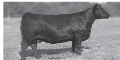
CJ Margo 106 - This 2018 KY State Fair Junior Show Reserve Supreme Champion sells safe to CCC Womack's Ace.