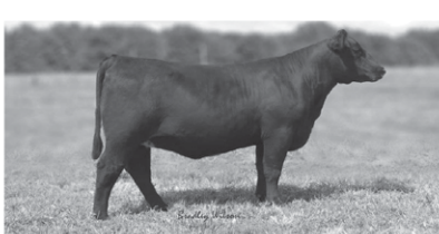
Hammerhead Phyllis F008 - A top notch set of fall calving two-year olds and Spring calving heifers will be selling including this granddaughter of PVF Insight 0129.