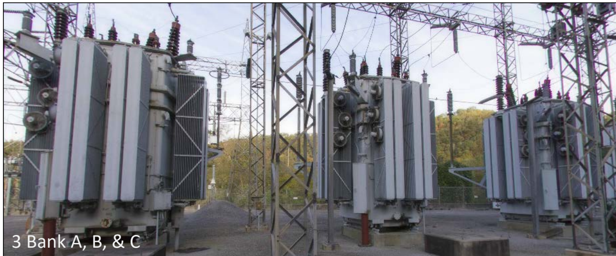
3 Bank A, B, & C

***Between the 2017 snapshot and today, Transformer 3 Bank Spare's status was changed to "Not in service". The Asset Health Center does not analyze transformers with a status of "Not In Service." Therefore, we are unable to produce a health score for 2015 and 2016 snapshots.