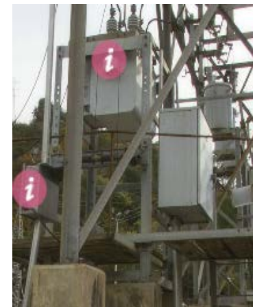
12kV Hazard CB C 1