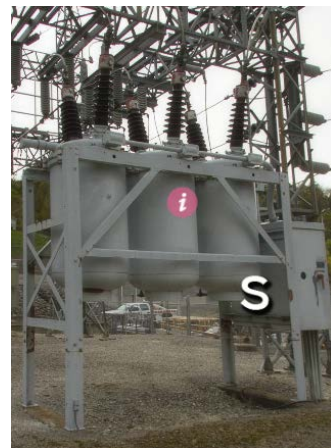
69kV BonnymanA #2 CB R