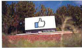
Facebook says it had worked on its advertising with the U.S. Department of Housing and Urban Development.