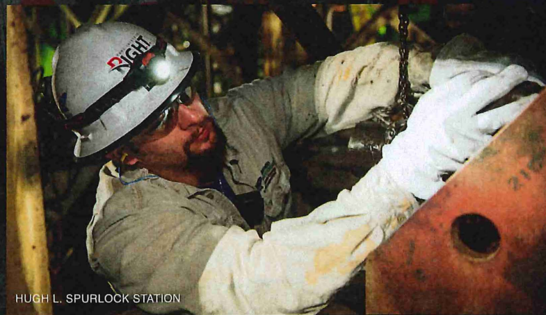
HUGH L. SPURLOCK STATION