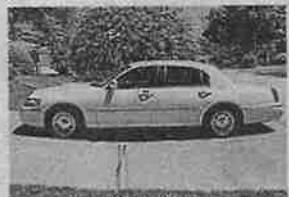
Lincoln 2001 Town Car Like new, must see, 502-491-2949